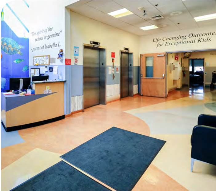
RECEPTION AREA WITH ELEVATORS