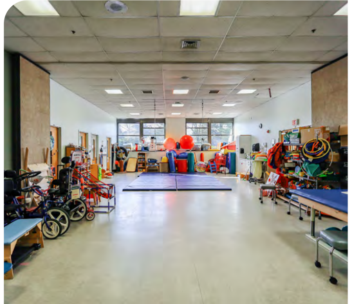
LARGE GYMNASIUM/THERAPY AREA