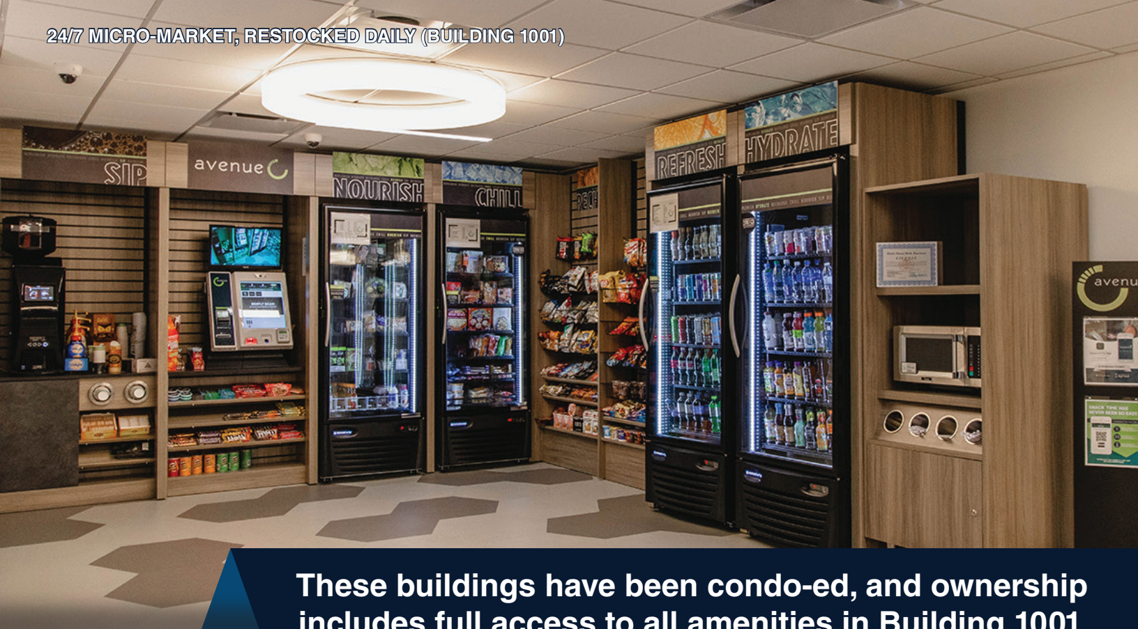
24/7 MICRO-MARKET, RESTOCKED DAILY (BUILDING 1001)

These buildings have been condo-ed, and ownership includes full access to all amenities in Building 1001.