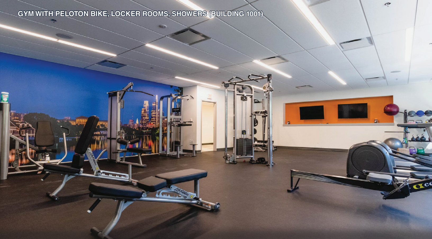
GYM WITH PELOTON BIKE, LOCKER ROOMS, SHOWERS (BUILDING 1001)