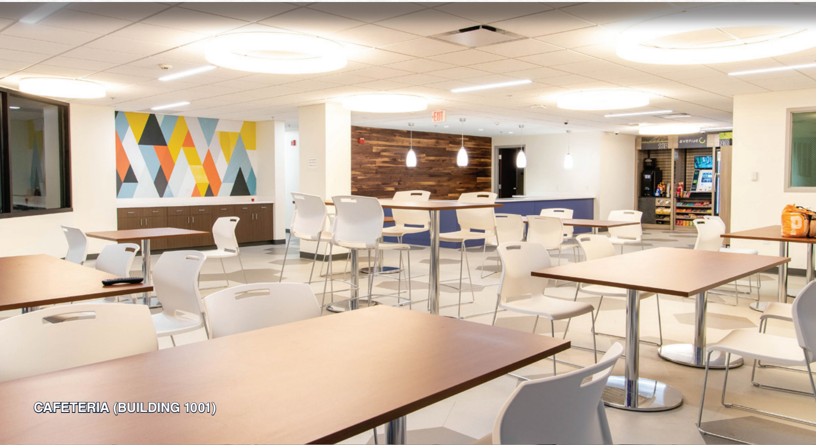
CAFETERIA (BUILDING 1001)