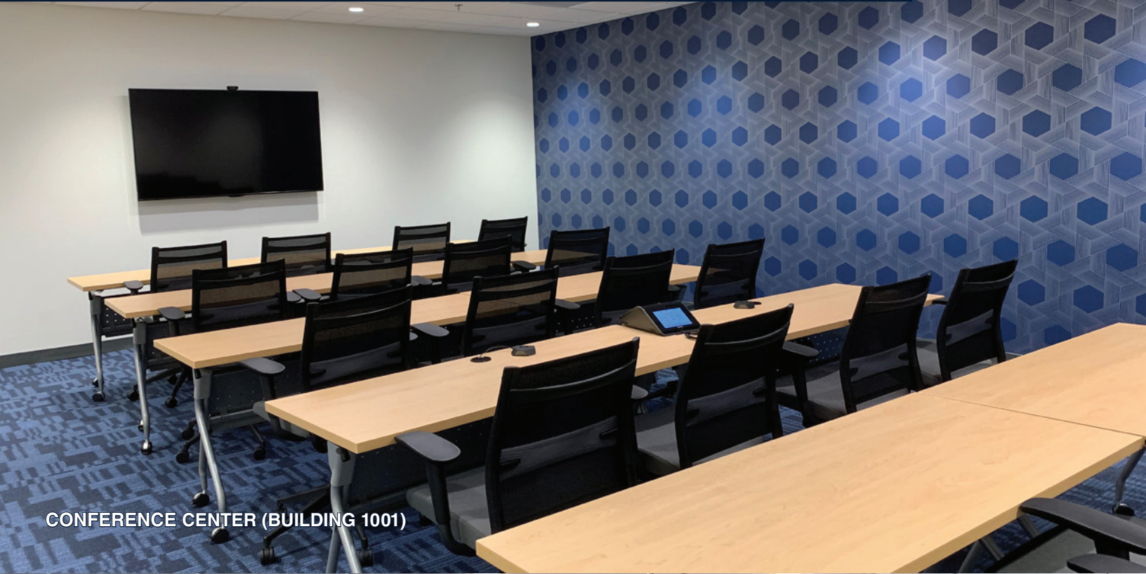
CONFERENCE CENTER (BUILDING 1001)