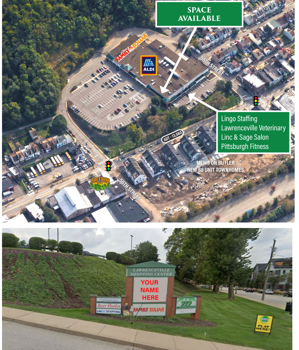
All information furnished regarding property for sale, rental or financing is from sources deemed reliable. No representation is made as to the accuracy thereof, and it is submitted subject to errors, omissions, change of price, rental, or other conditions, prior sale lease, financing or withdrawal without notice. Ballymoney Real Estate will make no representation, and assume no obligation, regarding the presence or absence of toxic or hazardous waste or substances or other undesirable material on or about the property.