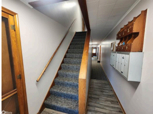
Main floor hall and stairs to 2nd floor