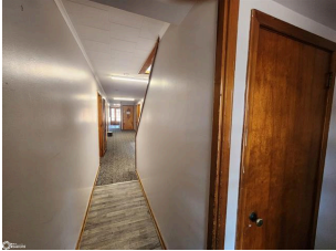
View from rear entry