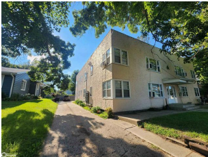
Drive to parking area