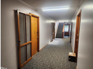
Main floor hall