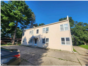
Rear of building