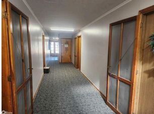
Main floor hall