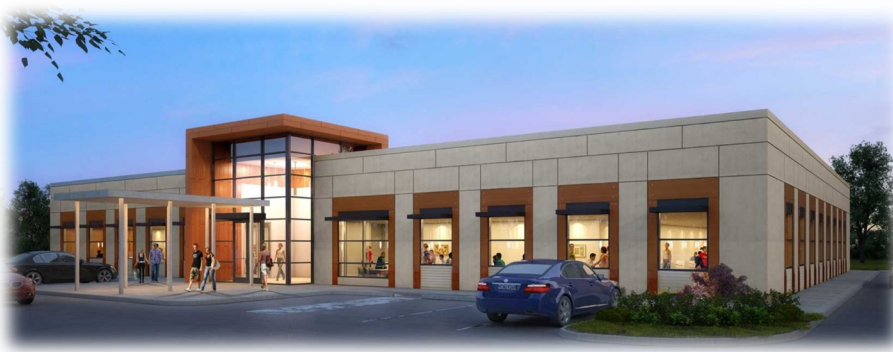
Conceptual Rendering Only