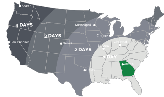
TRUCK TRANSIT TIMES FROM GEORGIA