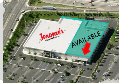
(Not to Scale)