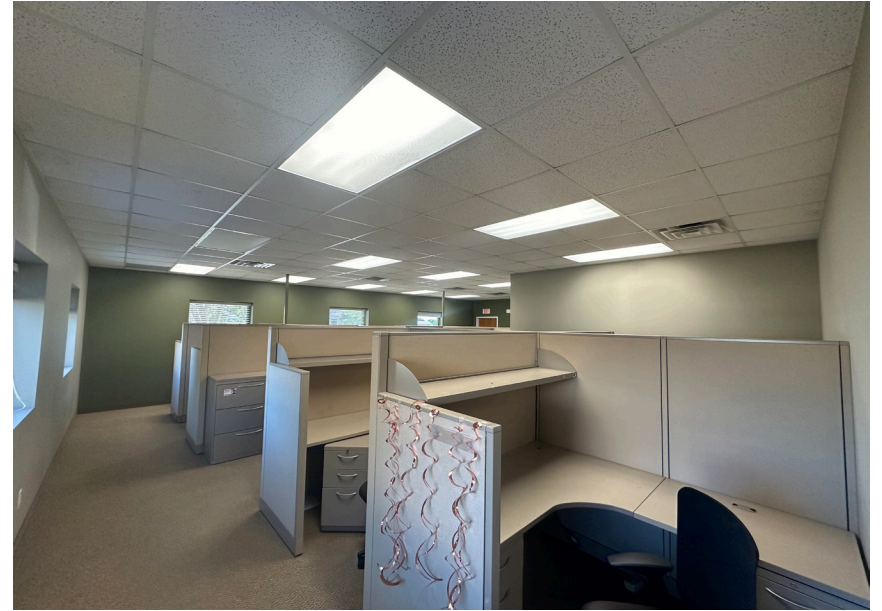
Cubicles are negotiable to stay.