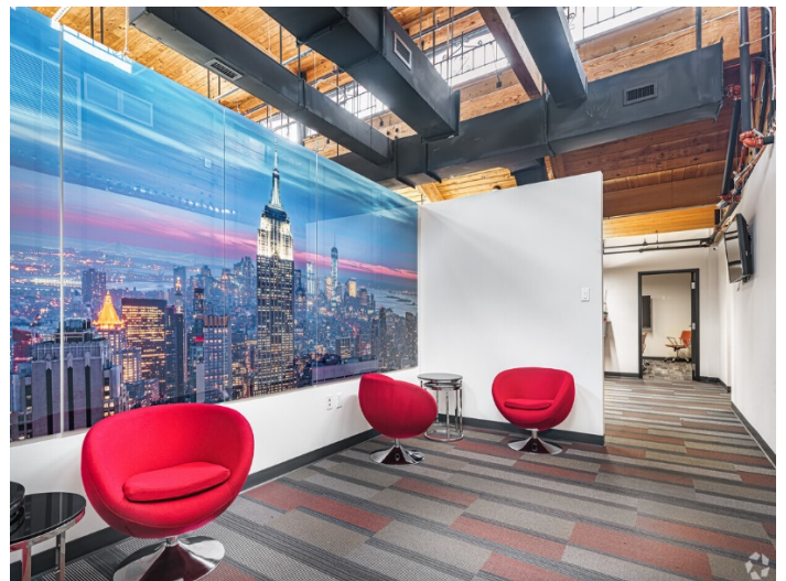
Second Floor Lobby