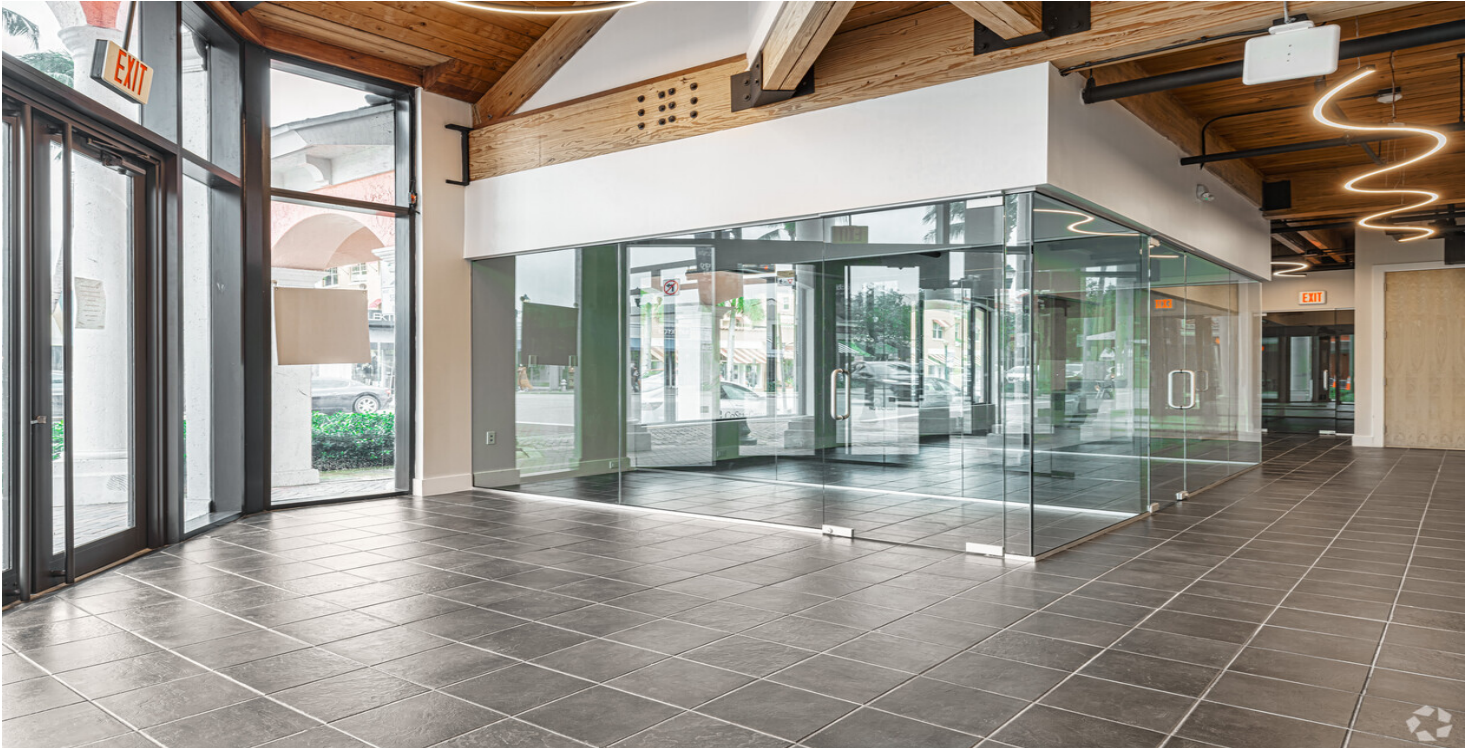
First Floor Lobby