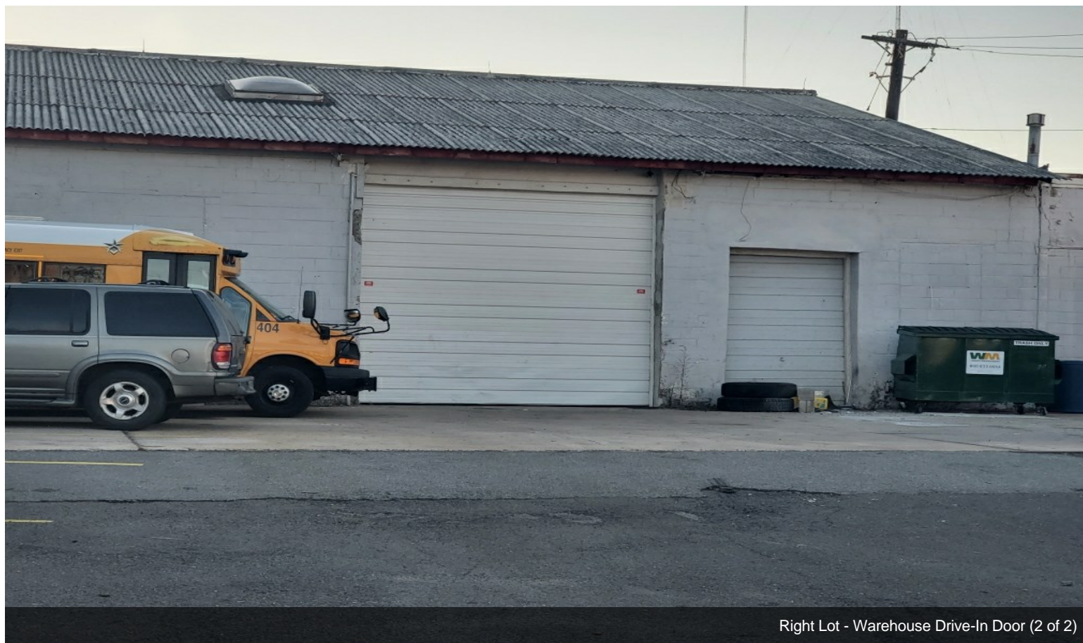
Right Lot - Warehouse Drive-In Door (2 of 2)