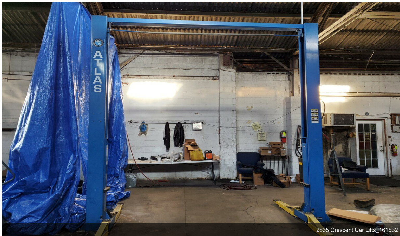
2835 Crescent Car Lifts_161532