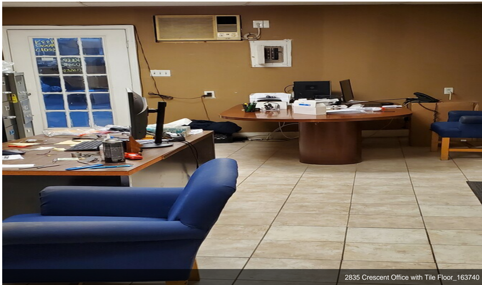
2835 Crescent Office with Tile Floor_163740