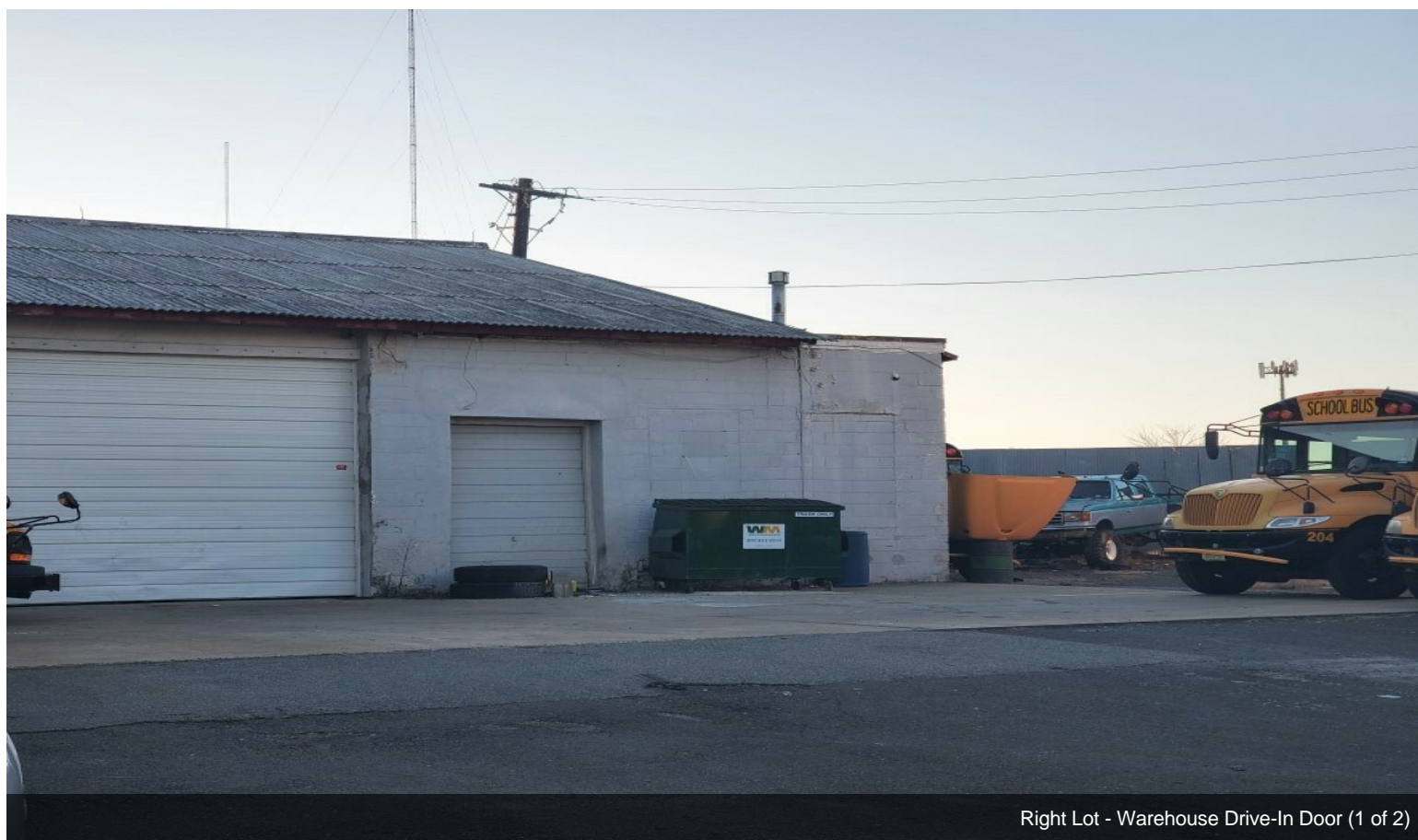
Right Lot - Warehouse Drive-In Door (1 of 2)