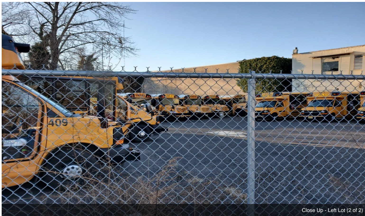
Close Up - Left Lot (2 of 2)