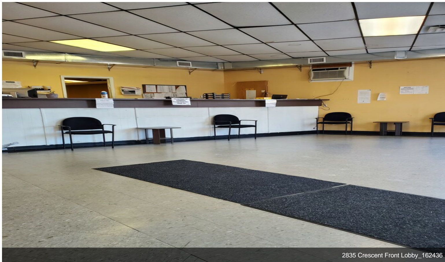
2835 Crescent Front Lobby_162436