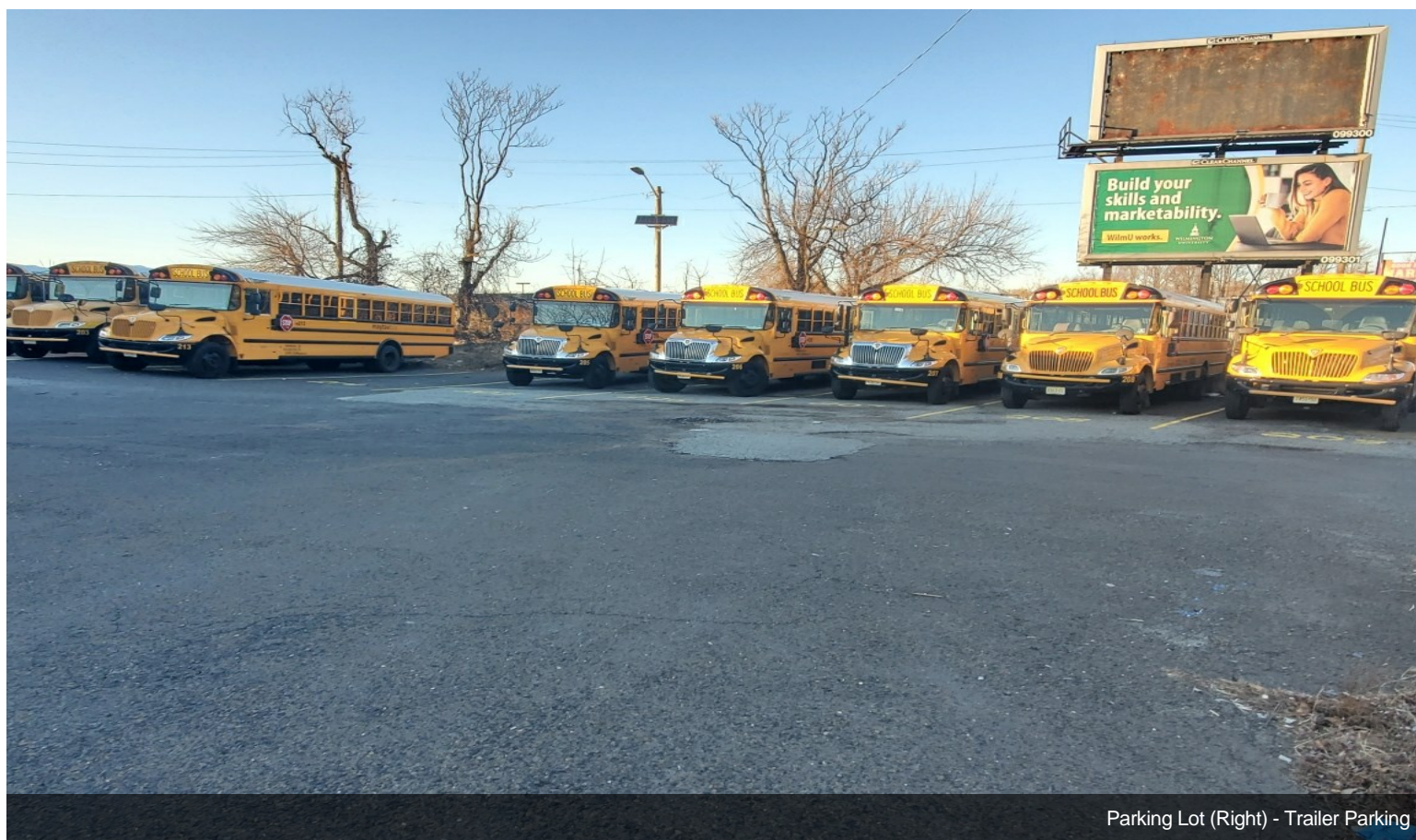
Parking Lot (Right) - Trailer Parking