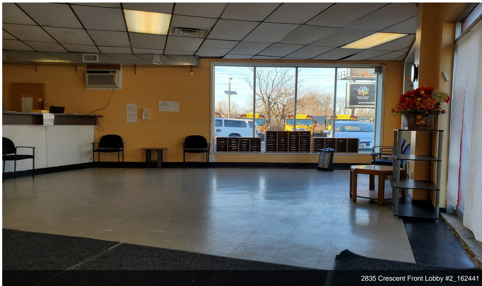
2835 Crescent Front Lobby #2_162441