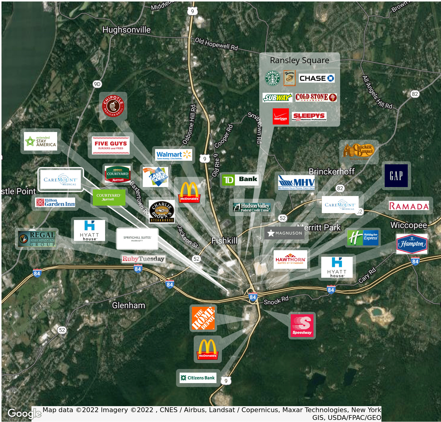
Google Map data ©2022 Imagery ©2022 , CNES / Airbus, Landsat / Copernicus, Maxar Technologies, New York GIS, USDA/FPAC/GEO

I-84 | TACONIC STATE PARKWAY | NYS THRUWAY AREA/I-87