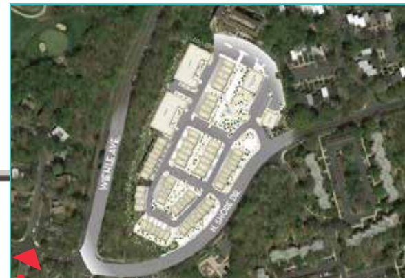
Tall Oaks Village Center 12040 North Shore Drive

Wiehle Avenue and North Shore Drive | Reston, VA 20190