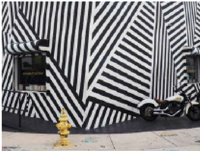
DORSEY + WYNWOOD

Wynwood is the art and soul of Miami. The former warehouse district has become the arts hub of South Florida with works and galleries by up and coming and established artists. What started with murals, street art and graffiti has transformed into a must see neighborhood for food, shopping, living and working. The area is recognized globally as the premier destination for art, fashion, innovation and creativity where a new generation of entrepreneurs want to live, work and play. A Dutch-inspired woonerf is in the planning and approval stages for Wynwood which would further add to the appeal. A living street designed with pedestrians and cyclists in mind and make more out of the outdoor spaces.