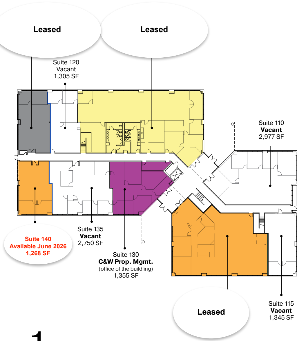
1 First Floor