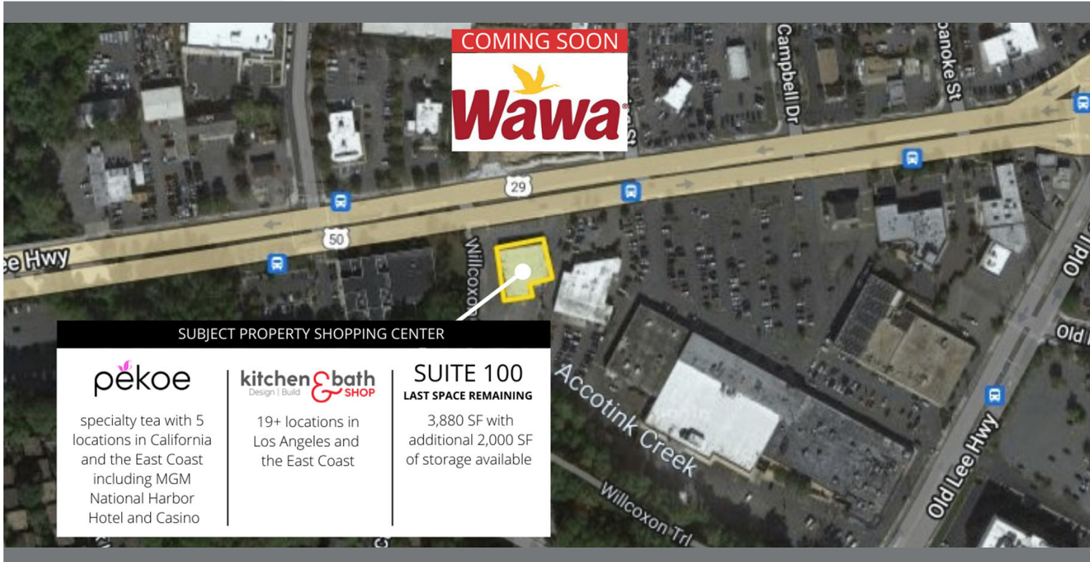
SUBJECT PROPERTY SHOPPING CENTER