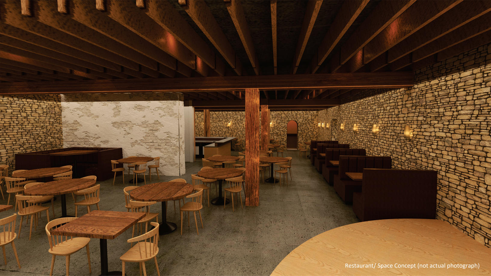
Restaurant/ Space Concept (not actual photograph)