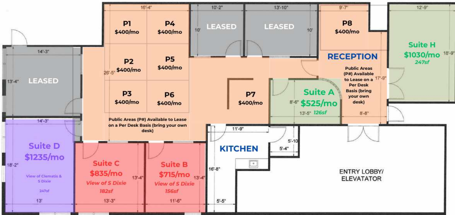
Suite 200 Office Floorplan