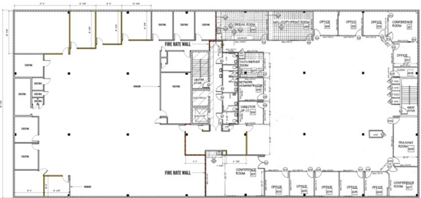
1 PROPOSED FLOOR PLAN 8.1 1/8" = 1'-0"