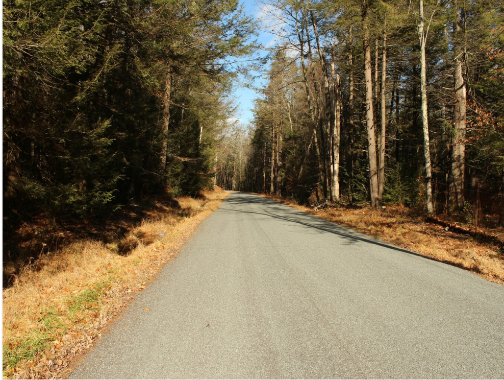
Catskills 45 plus Acre