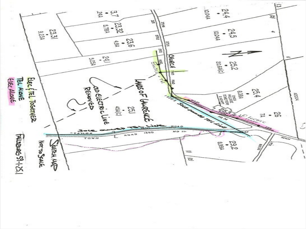
Map of Lot