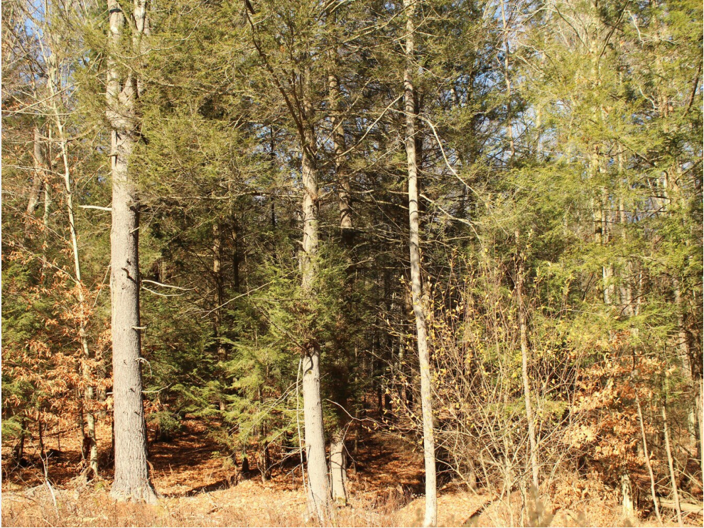
Catskills 45 plus Acre