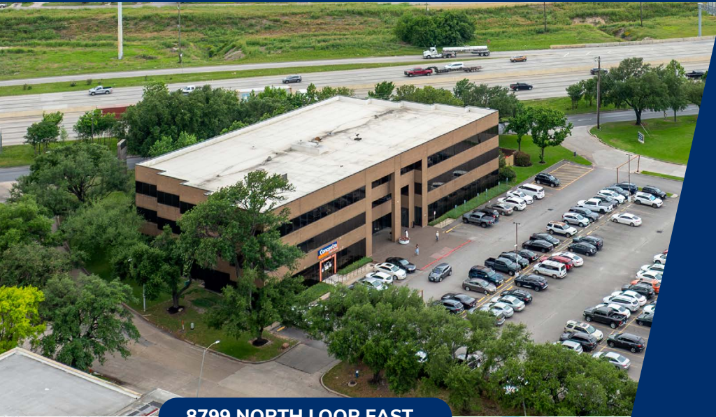
8799 NORTH LOOP EAST