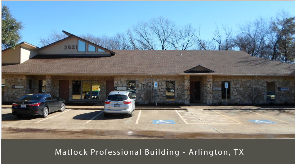
Matlock Professional Building - Arlington, TX

2621 - 2625 MATLOCK ROAD ARLINGTON, TX 76014