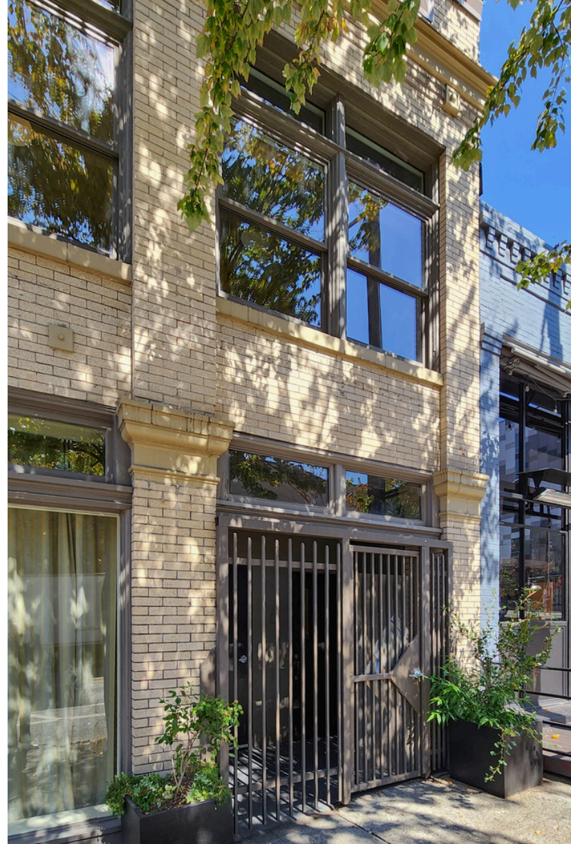
Above: Office Entrance