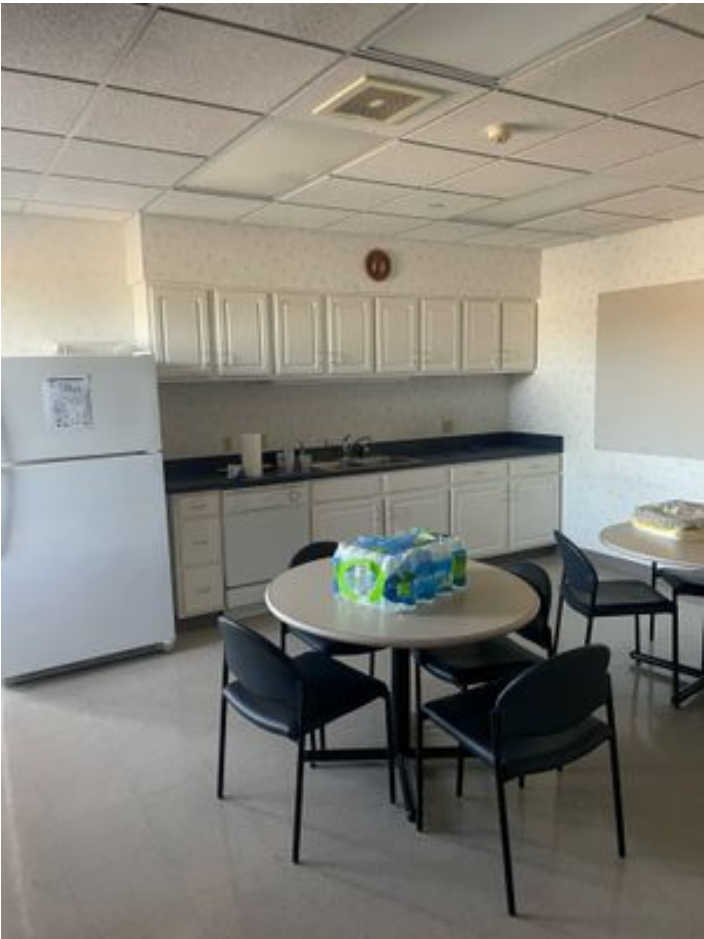
3529 - Hwy 41 N, 14601 (5)