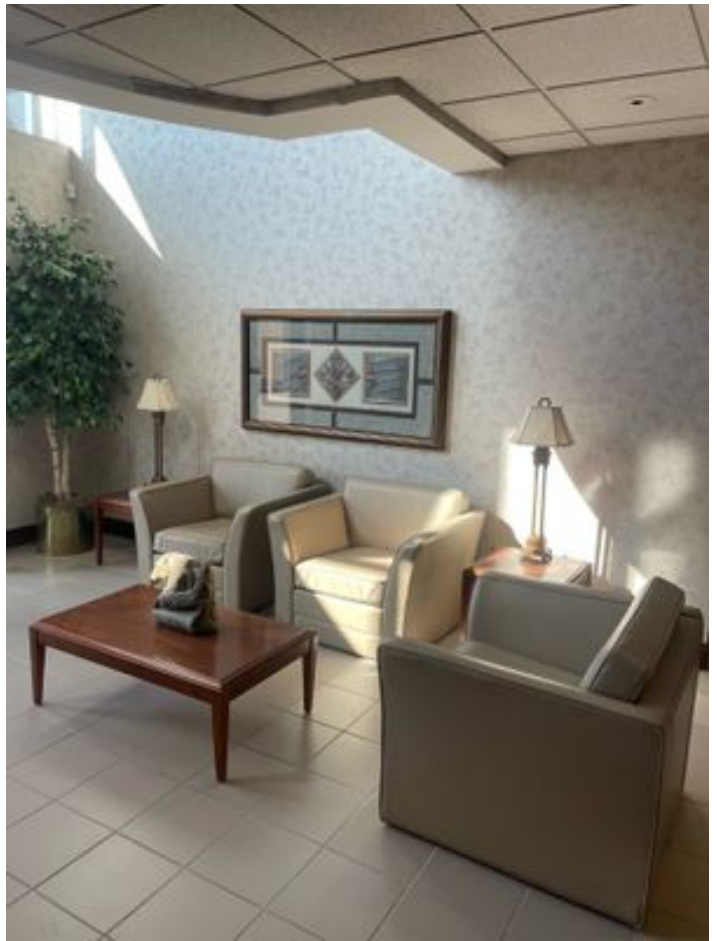
3529 - Hwy 41 N, 14601 (3)