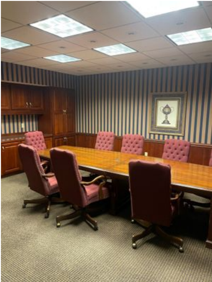
3529 - Hwy 41 N, 14601 (6)