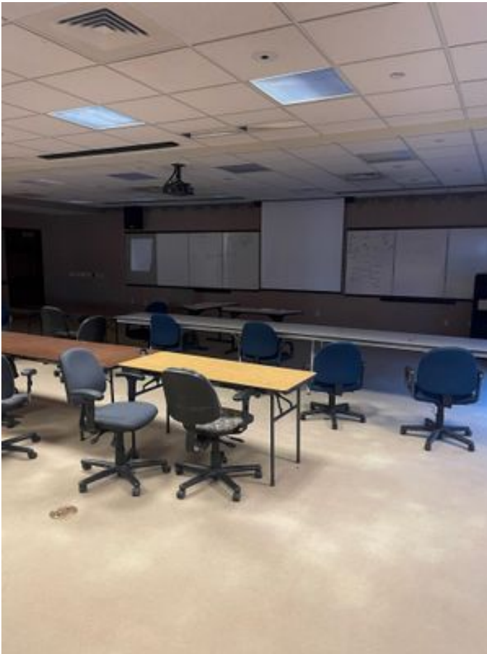
3529 - Hwy 41 N, 14601 (4)