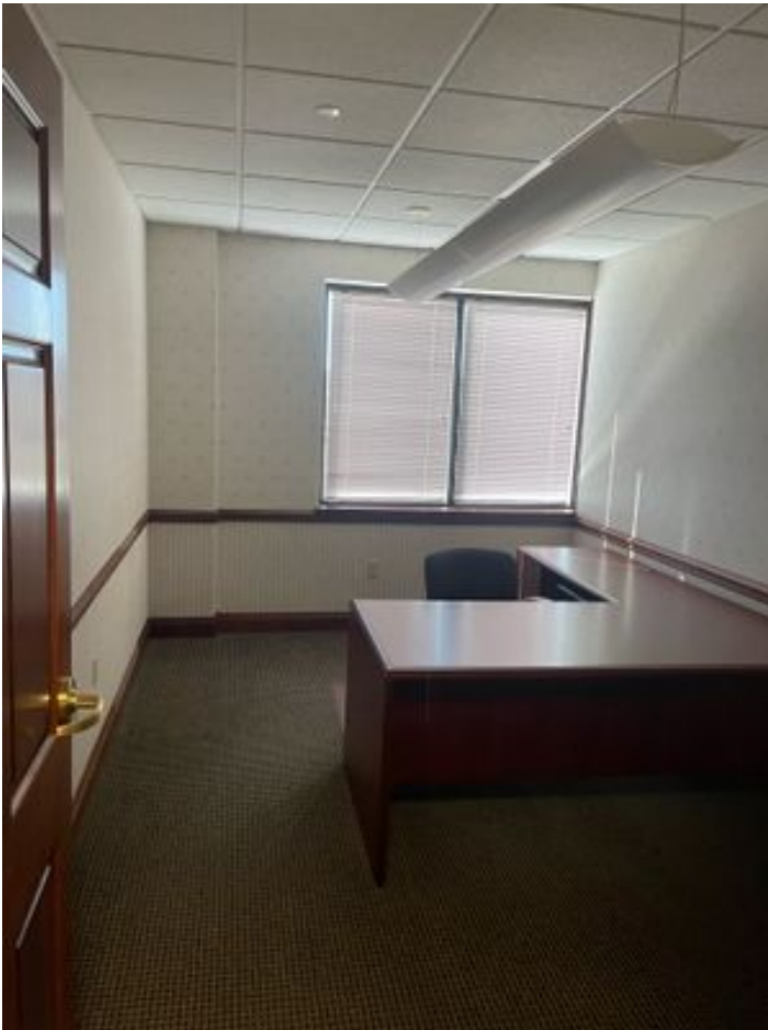
3529 - Hwy 41 N, 14601 (2)