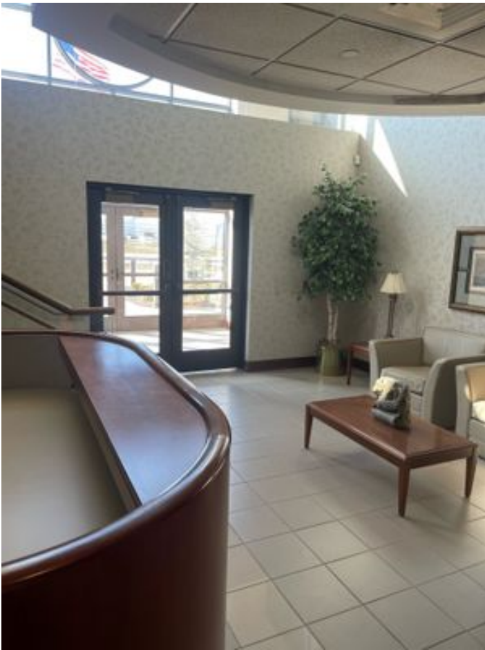
3529 - Hwy 41 N, 14601 (1)