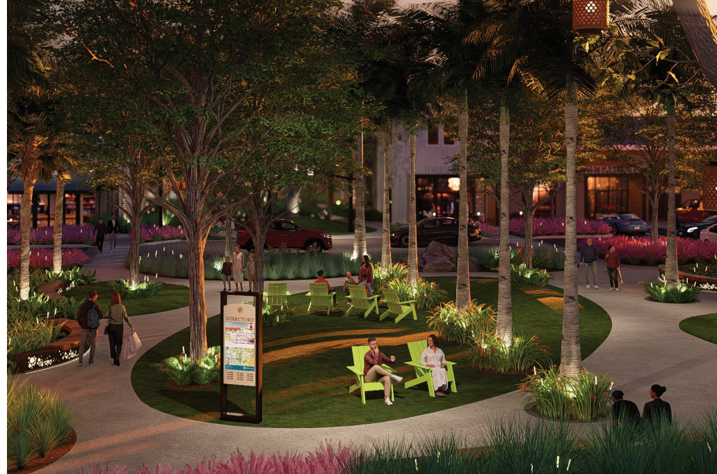
*PROPOSED RENDERINGS, SUBJECT TO CHANGE

We invite you to join us in creating a vibrant atmosphere filled with art, cuisine, music, shopping, fitness and more.