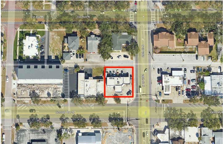
THE PROPOSED RETAIL BUILDING WILL BE CONSTRUCTED AT 2801 CENTRAL AVENUE IN THE GRANDCENTRAL DISTRICT | GOOGLE MAPS

A few doors down, local investor Rossi Bonugli plans to build a five-unit, 6,079-square-foot retail building at 2730 Central Avenue.