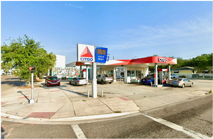
A FORMER CITGO GAS STATION ON THE CORNER OF CENTRAL AVENUE AND 28TH STREET IS SET TO BE REDEVELOPED INTO A NEW RETAIL DESTINATION | GOOGLE MAPS

Designed by Oldsmar-based ArchEvokeStudio LLC , the building would accommodate multiple retailers and restaurants, bringing new business opportunities to this stretch of the GrandCentral District.