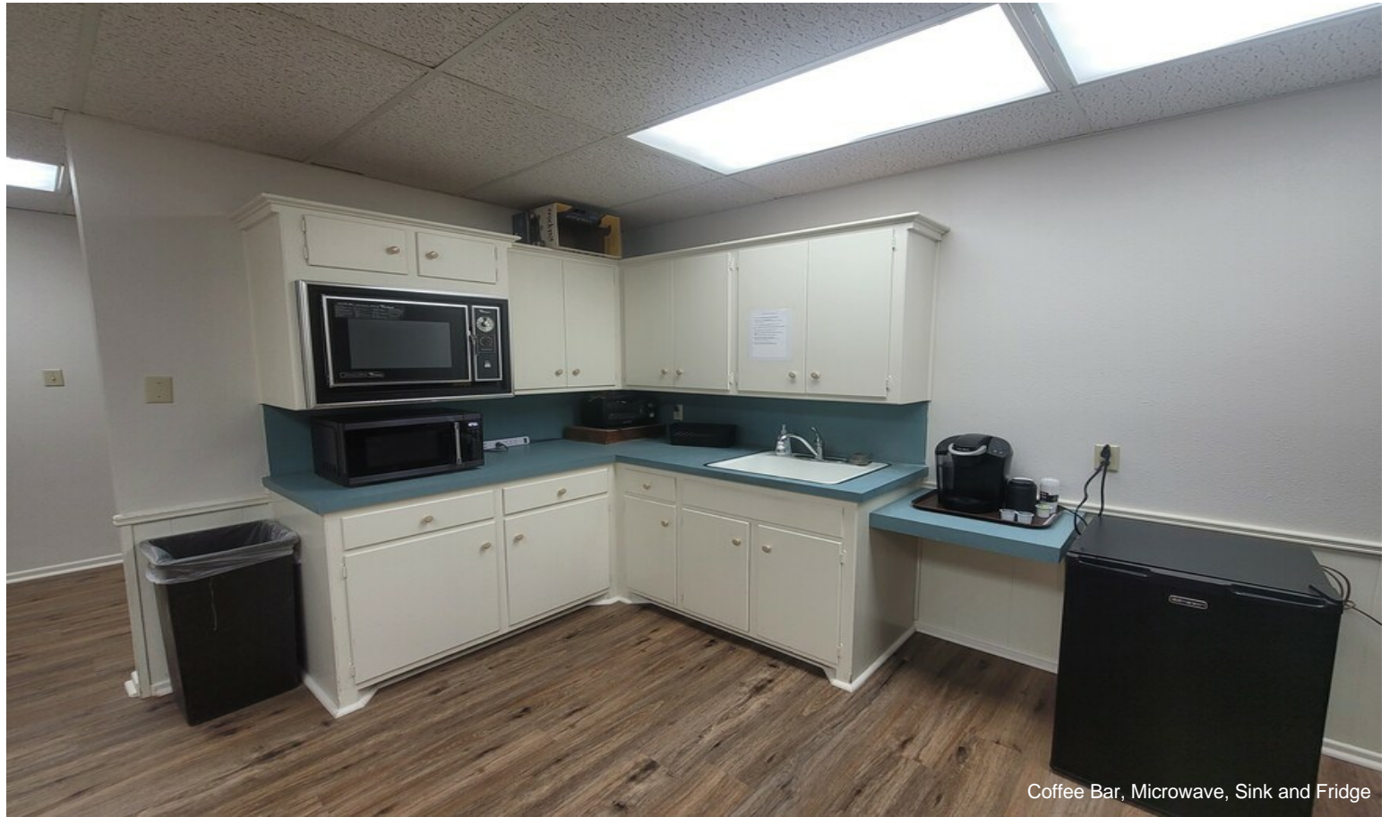
Coffee Bar, Microwave, Sink and Fridge