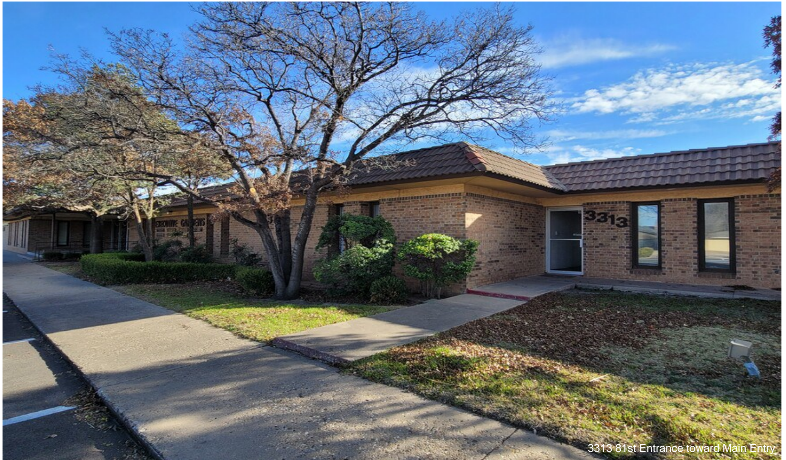
3313 81st Entrance toward Main Entry