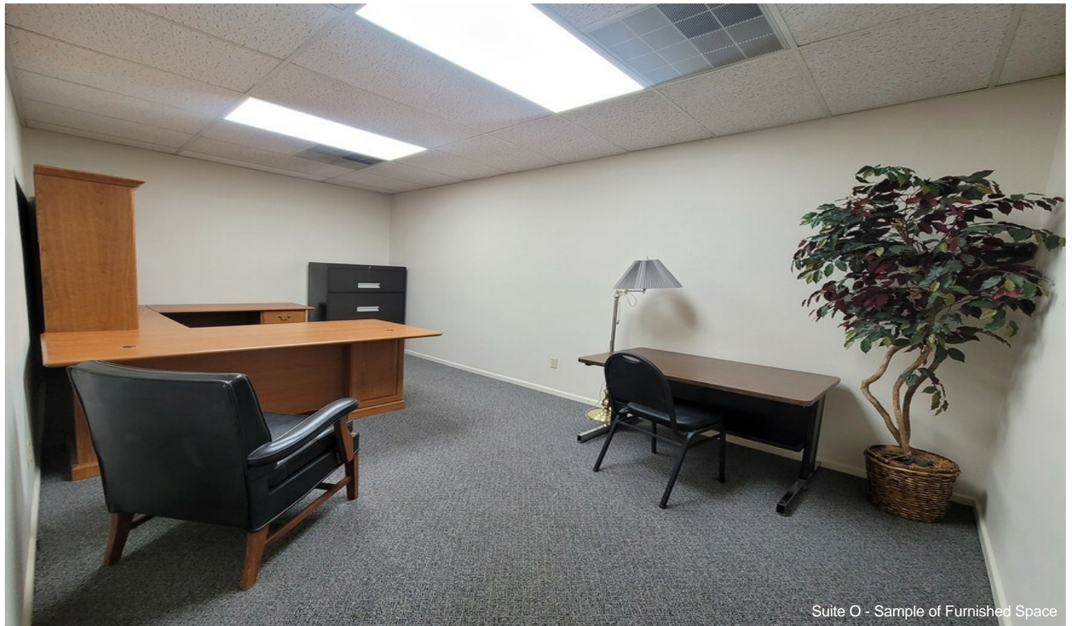
Suite O - Sample of Furnished Space