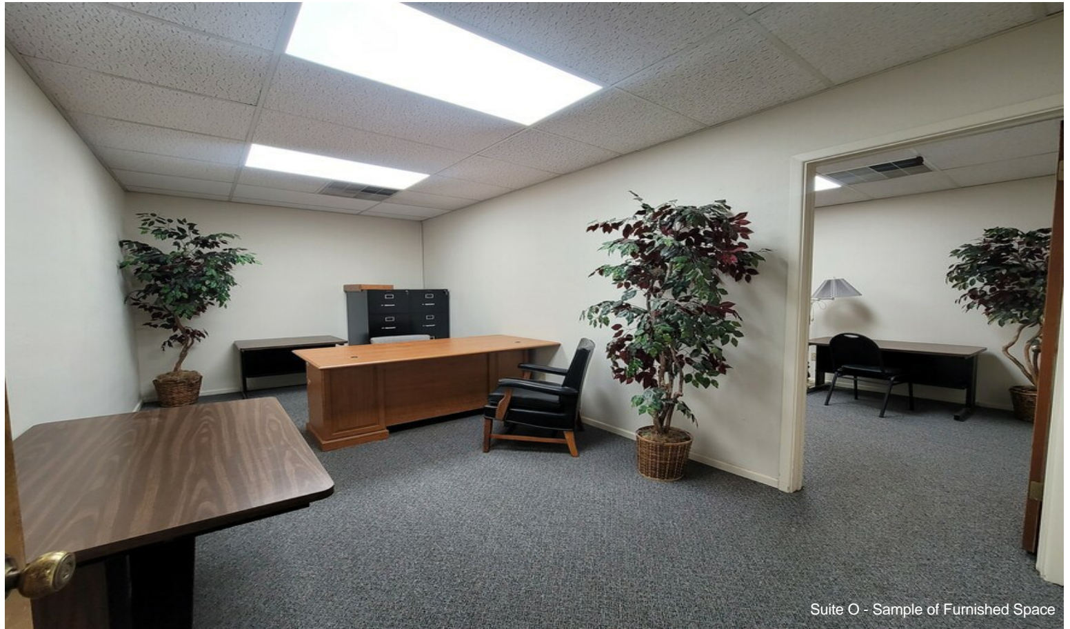
Suite O - Sample of Furnished Space