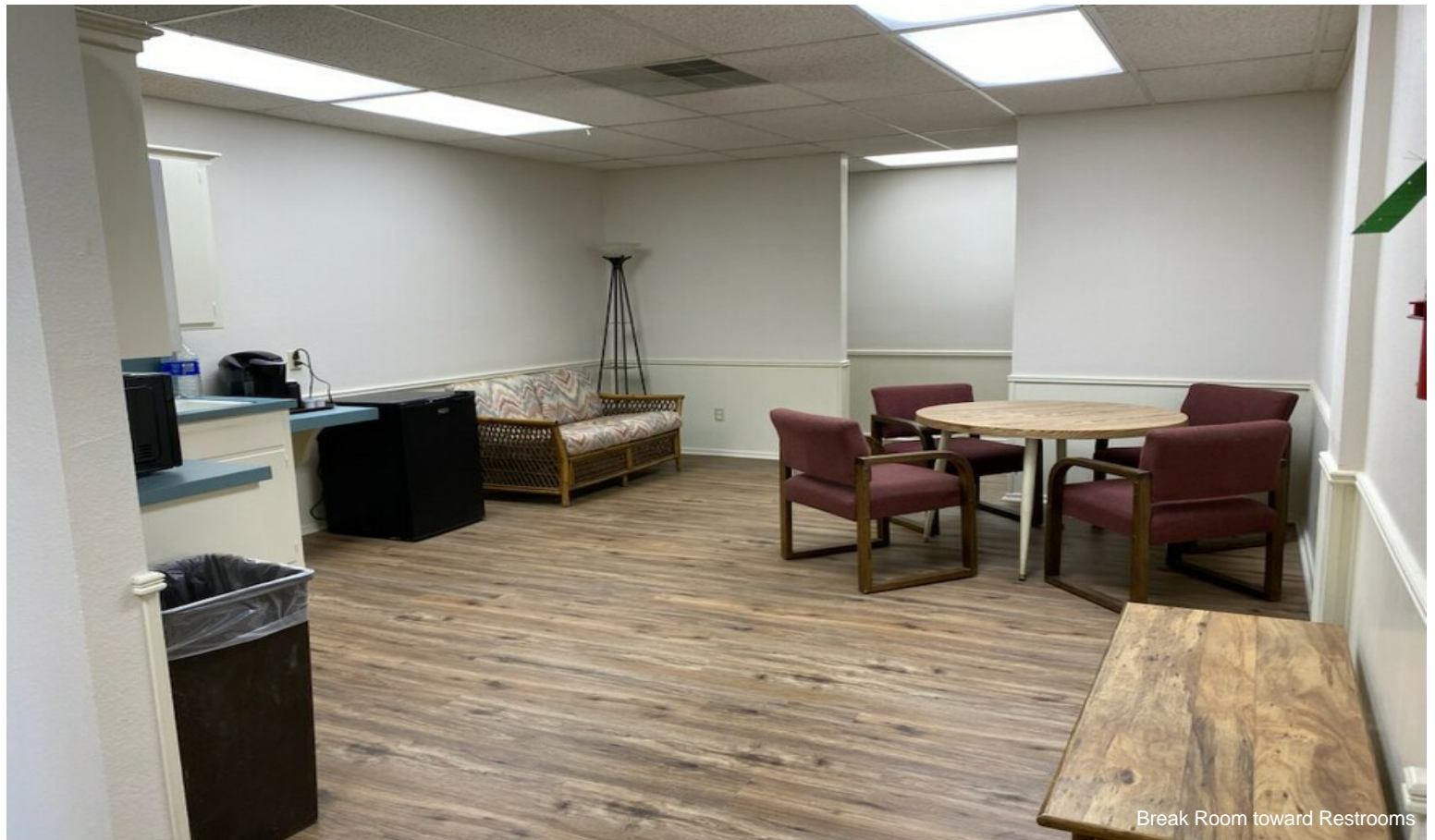
Break Room toward Restrooms