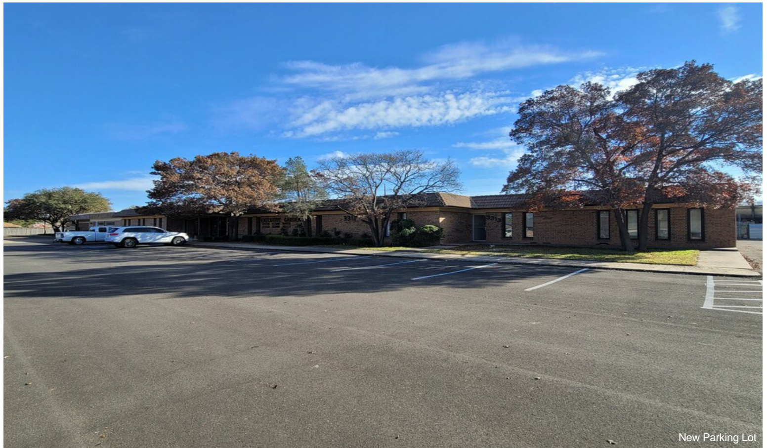
New Parking Lot