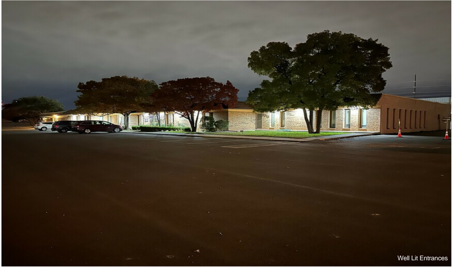
Well Lit Entrances