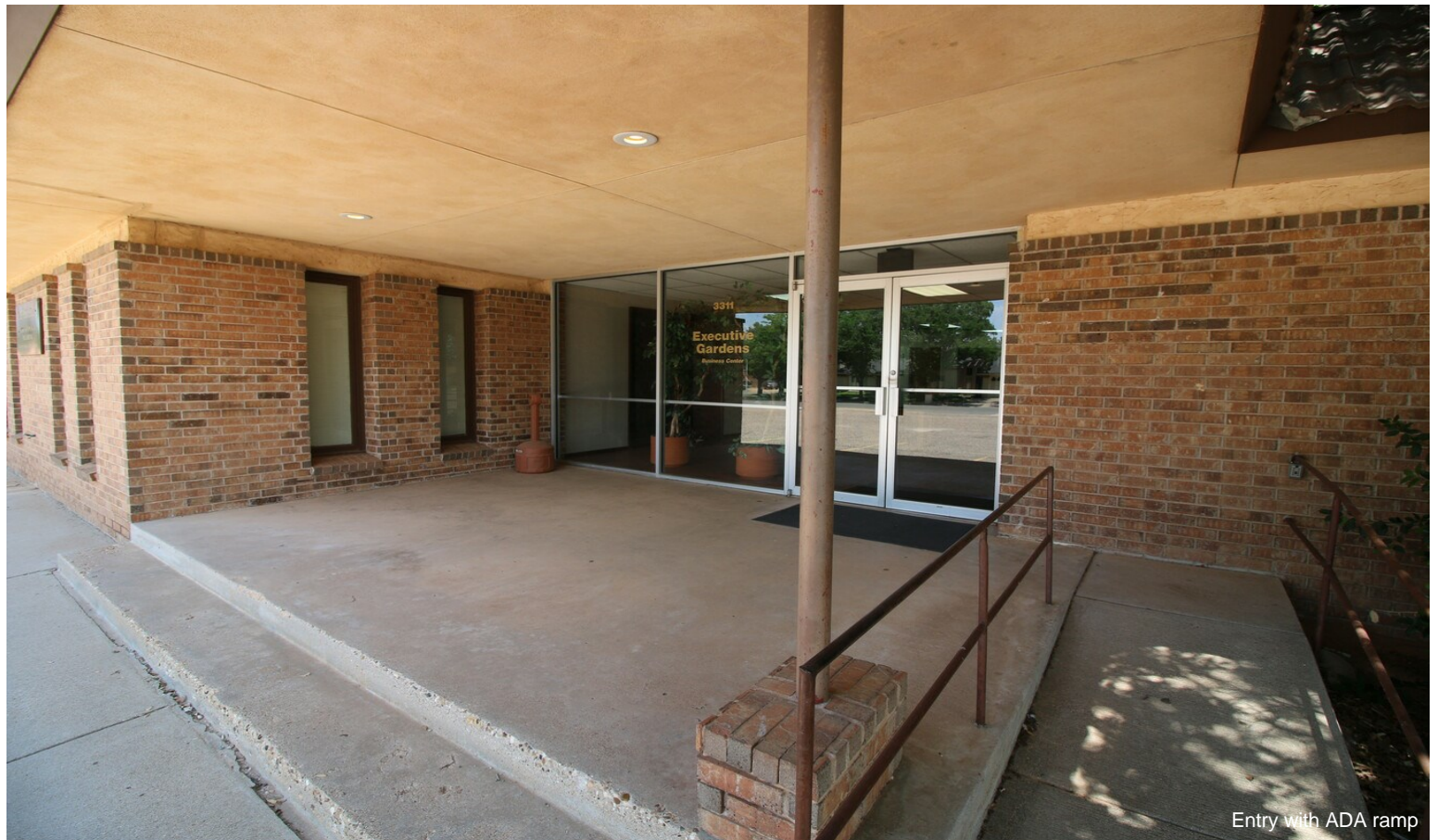
Entry with ADA ramp