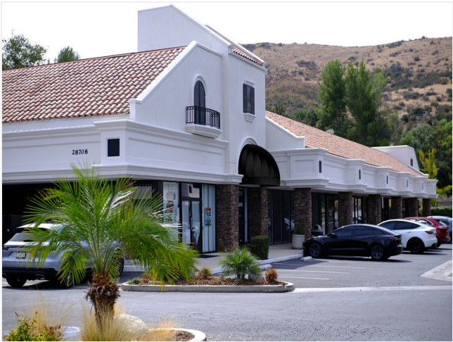
28708 building from restaurant corner 091322