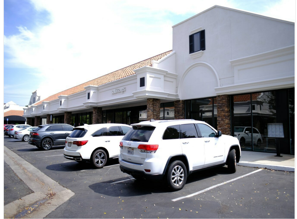
28708 bld from Agoura Rd 091322