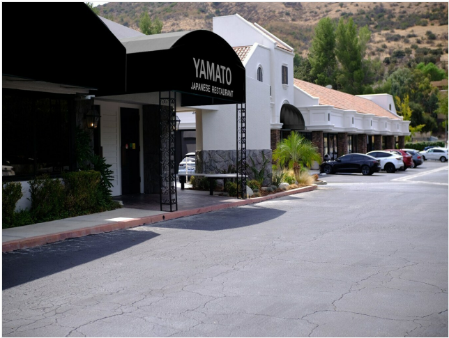
Yamato Ent from Parking 091322

28700-28716 Roadside Dr, Agoura Hills, CA 91301