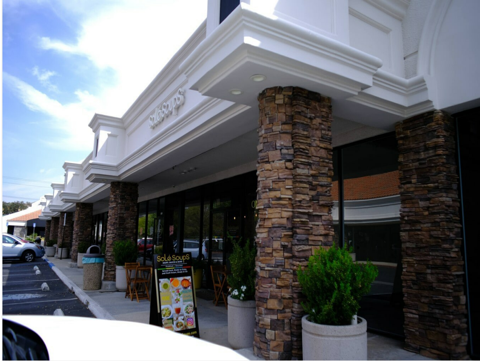
Sole Soups 091322