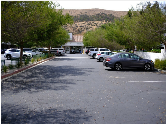
parking lot Roadsize 091322

28700-28716 Roadside Dr, Agoura Hills, CA 91301