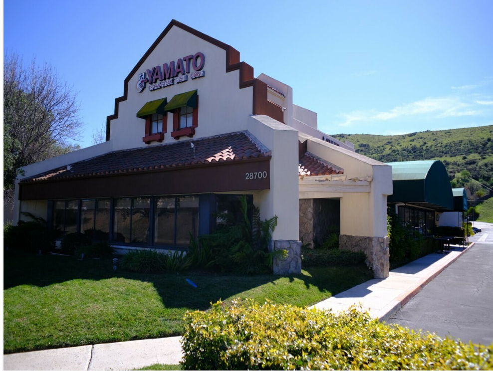
Yamato from North Curb