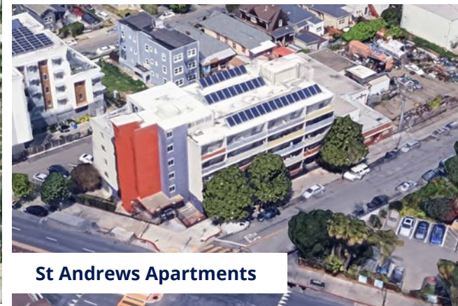
St Andrews Apartments