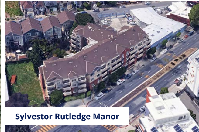
Sylvestor Rutledge Manor