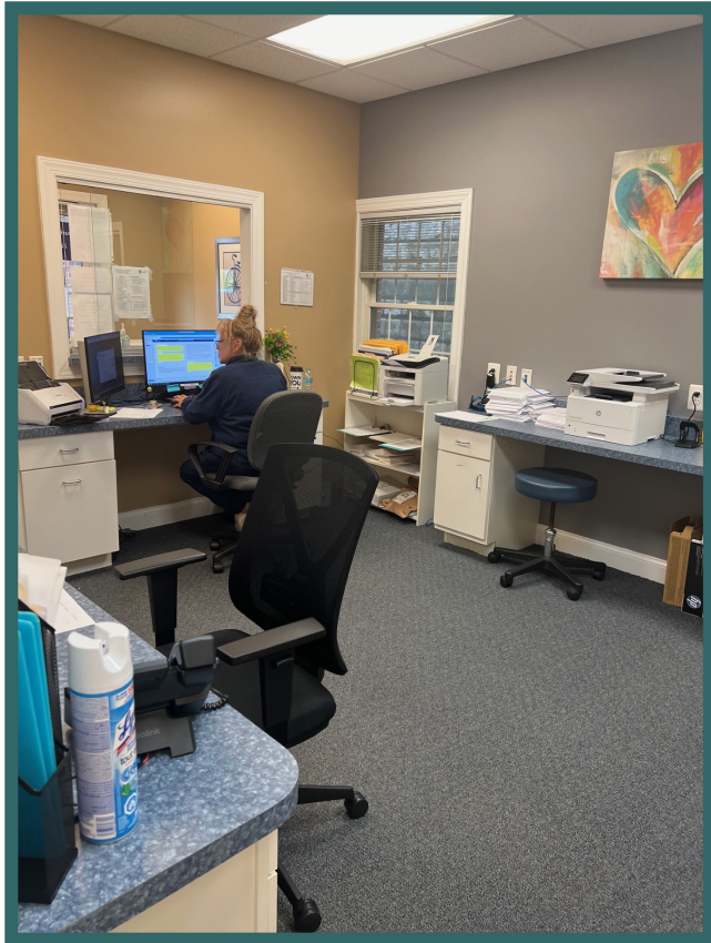
Office Staff Area