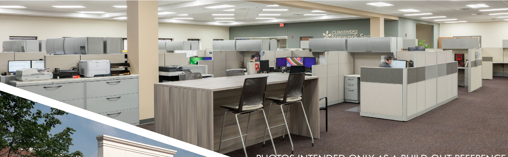
PHOTOS INTENDED ONLY AS A BUILD OUT REFERENCE

4665 44TH STREET SE | GRAND RAPIDS, MI 49512