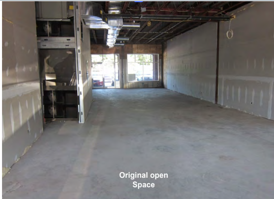
Original open Space

Contact: For information, pricing or to view property Call: Bruce Wenig (914)844-2478 Or Email:: Bwenig@houlihanlawrence.com www.brucewenig.com