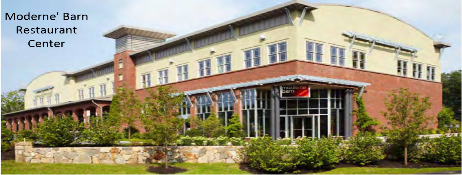
Moderne' Barn Restaurant Center