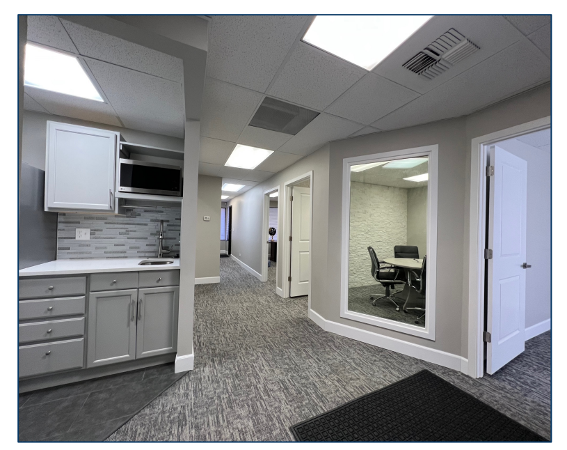
1st Floor Entrance