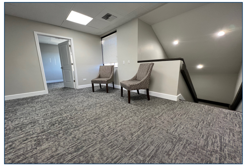
2<sup>nd</sup> Floor Lobby