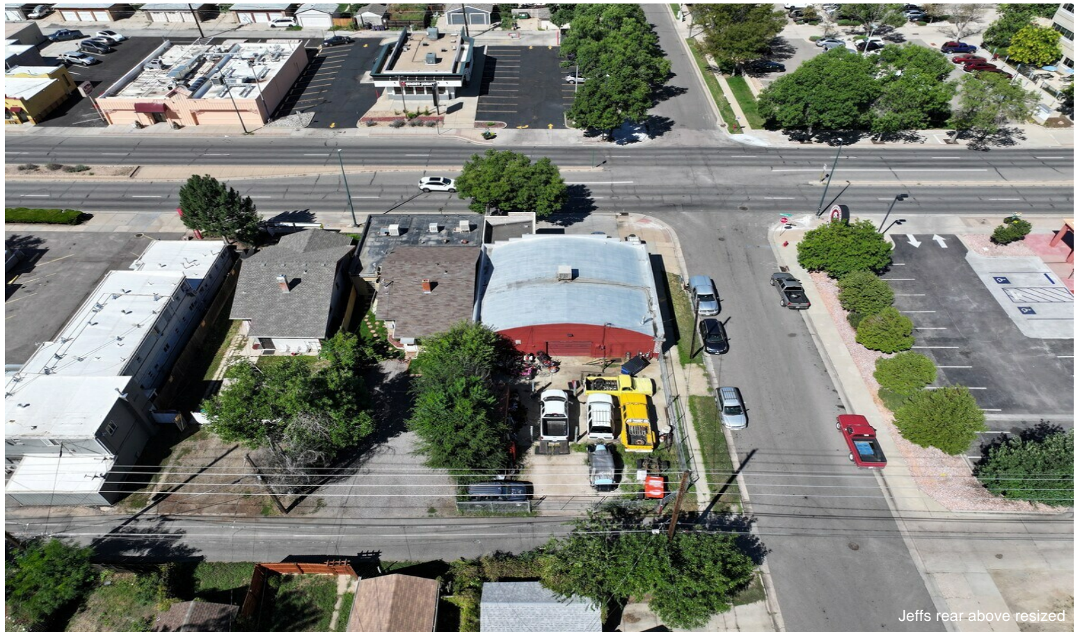
Jeffs rear above resized