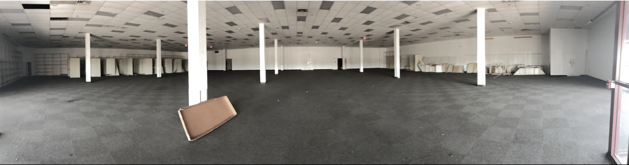
±18,200 Jr Anchor Space