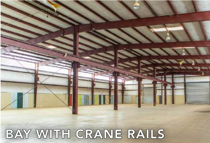
BAY WITH CRANE RAILS