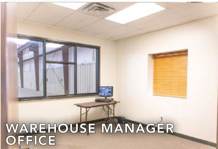
WAREHOUSE MANAGER OFFICE