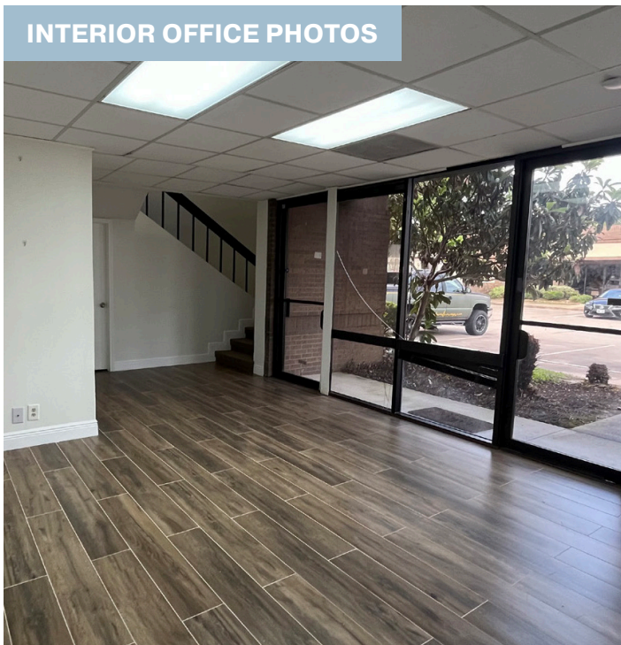
INTERIOR OFFICE PHOTOS