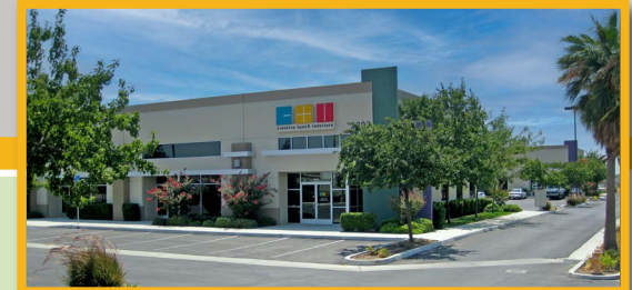
2809 Unicorn Road - Suite 102

2809 Unicorn Road - Suite 102 Bakersfield, CA