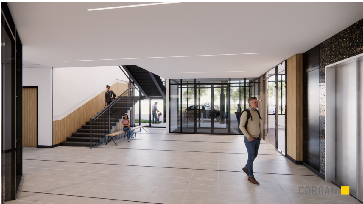
First floor lobby rendering.