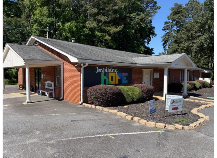
Activity Building with Large Rooms