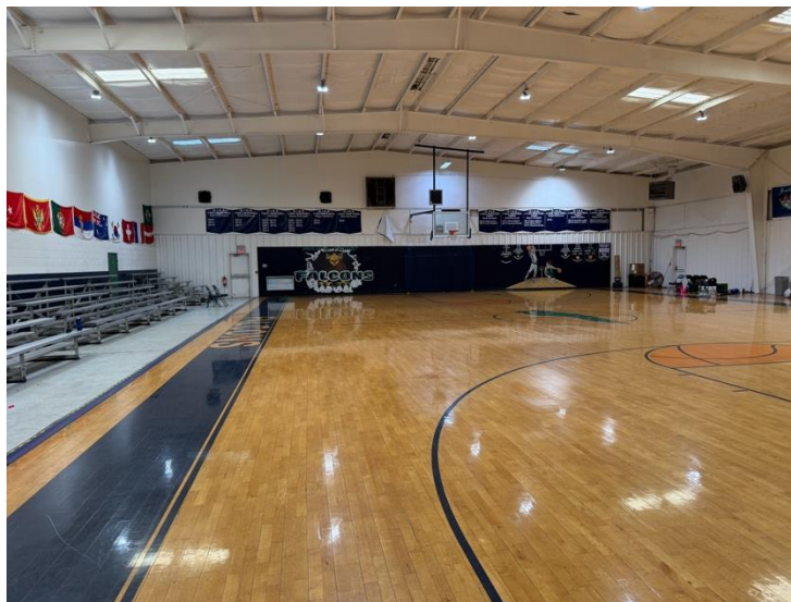
Regulation hardwood gymnasium with bleacher seating

The information provided herein is deemed reliable but is not warranted. Any information important to you or another party should be independently confirmed within an applicable due diligence period.