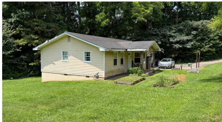
2 Bedroom Home