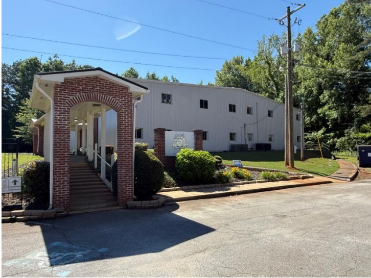
Gym and Classroom Building