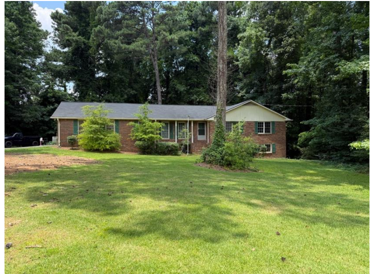
Brick Ranch Home