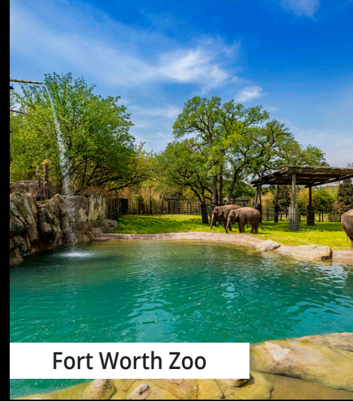
Fort Worth Zoo