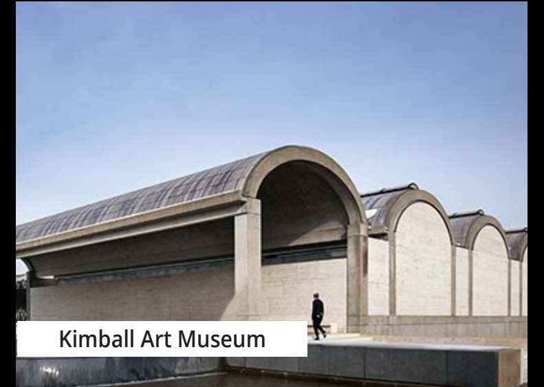
Kimball Art Museum