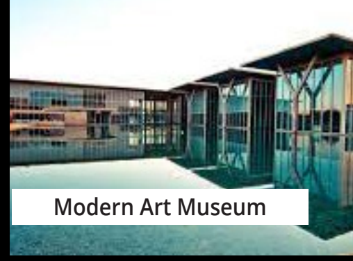
Modern Art Museum