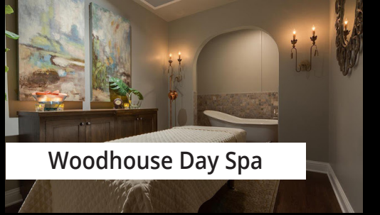
Woodhouse Day Spa