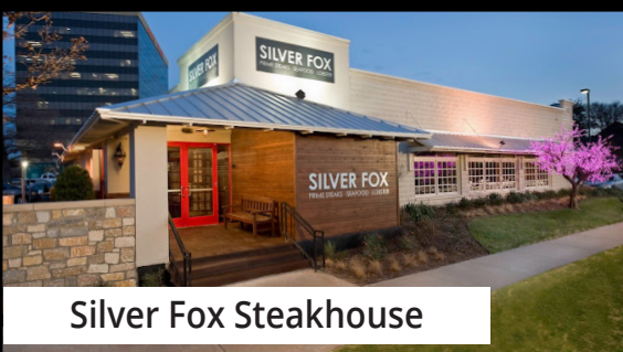
Silver Fox Steakhouse