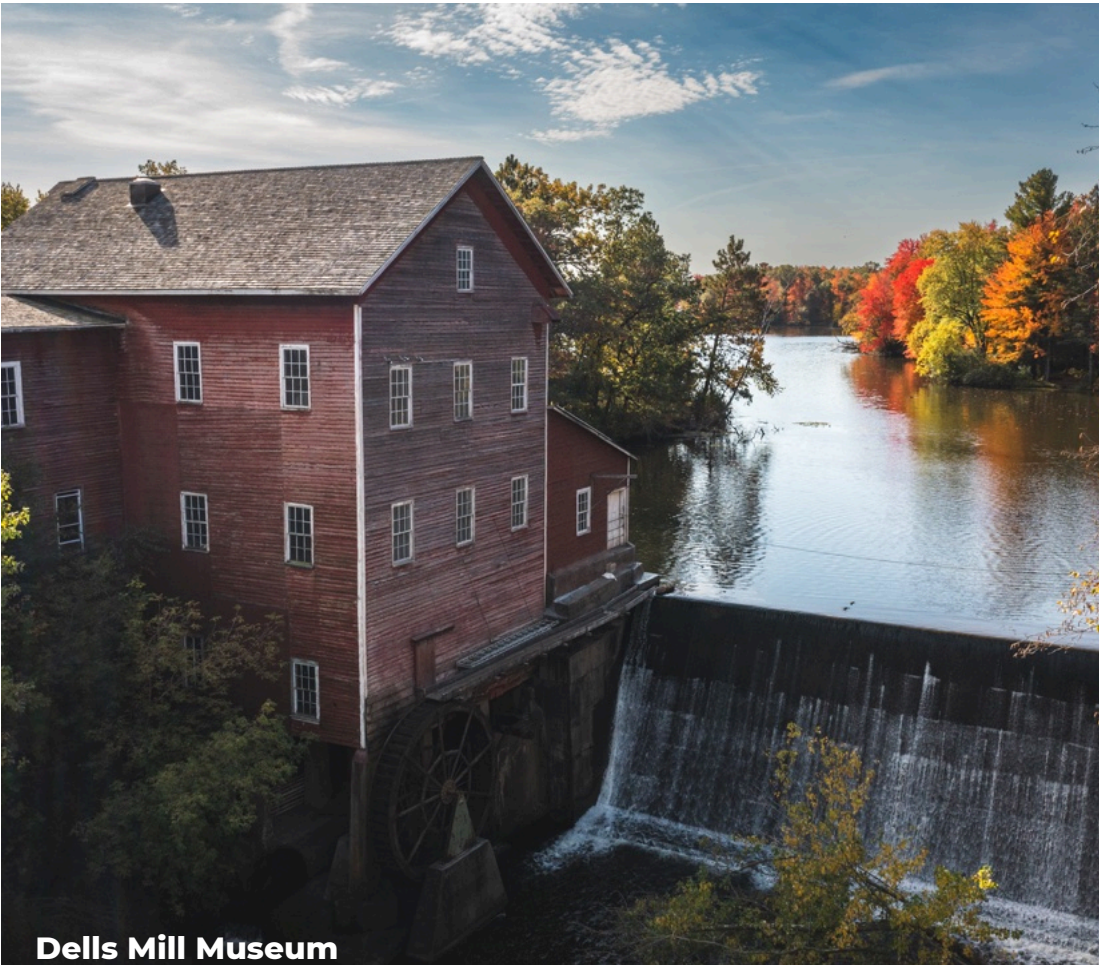
Dells Mill Museum

Augusta, Wisconsin, is situated in west-central Wisconsin, approximately 10 miles north of Interstate 94 and bordered by the Town of Bridge Creek.