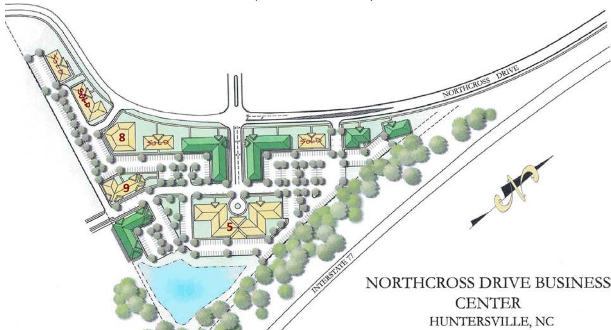
NORTHCROSS DRIVE BUSINESS CENTER HUNTERSVILLE, NC

Northcross Drive, Huntersville, North Carolina