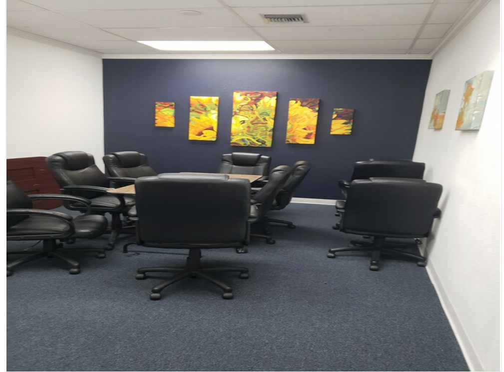
Office off reception area with glass door