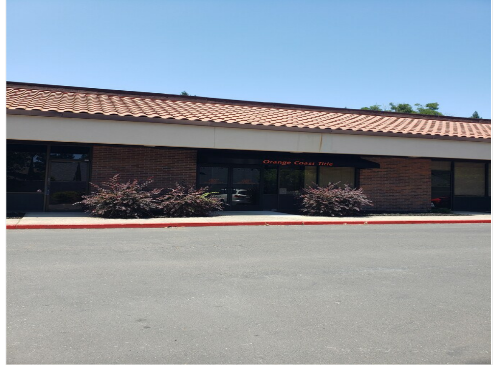
Front of building, back faces Sunrise Blvd.