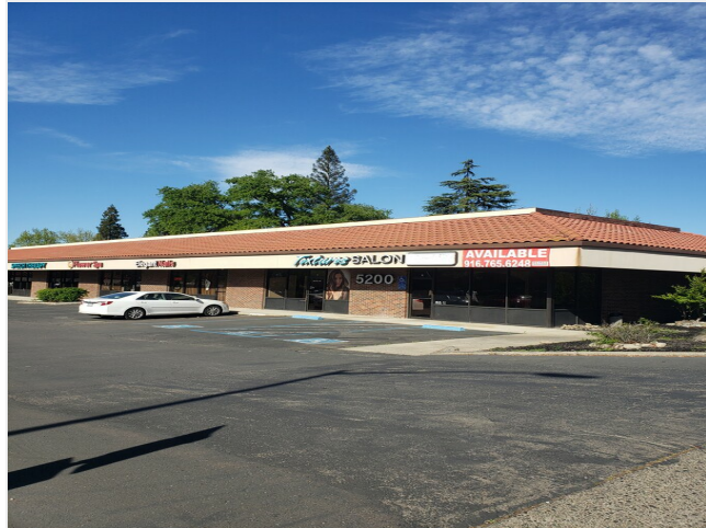
Salon exterior 2