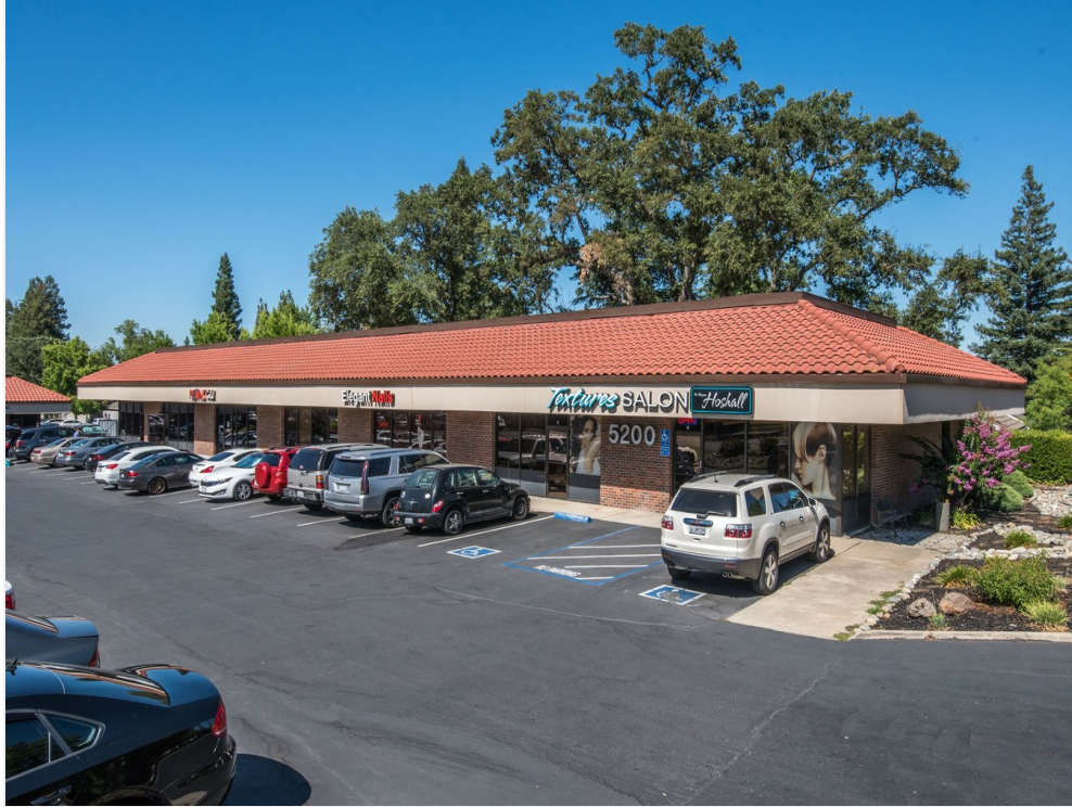
5200 Sunrise Blvd- south side north with landscaping