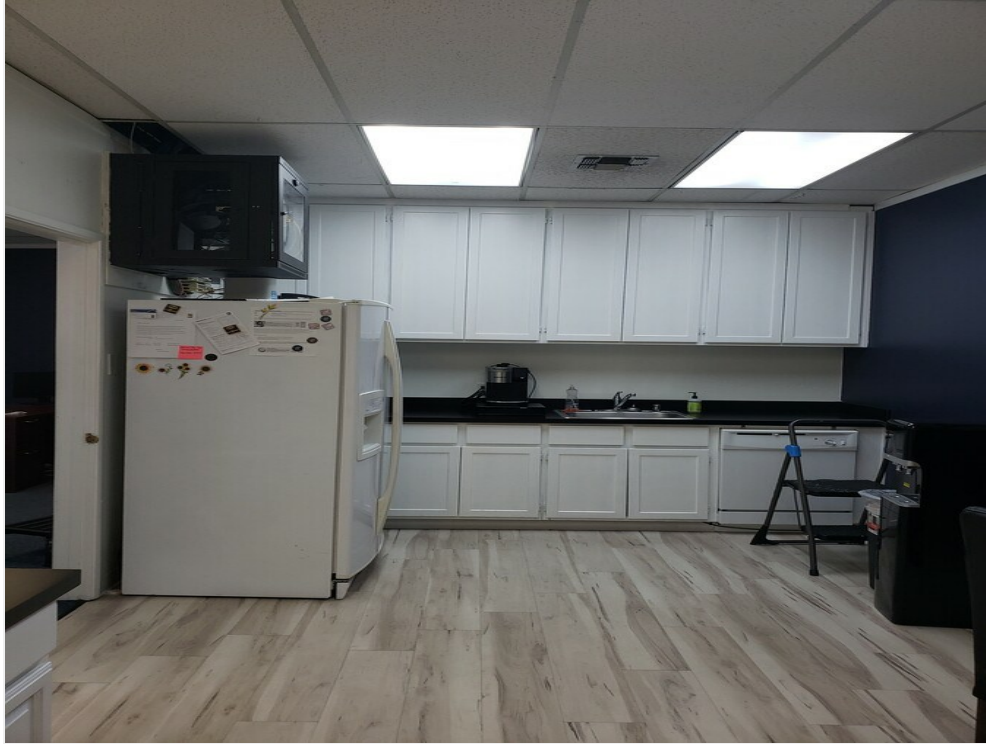
Kitchen area with sink