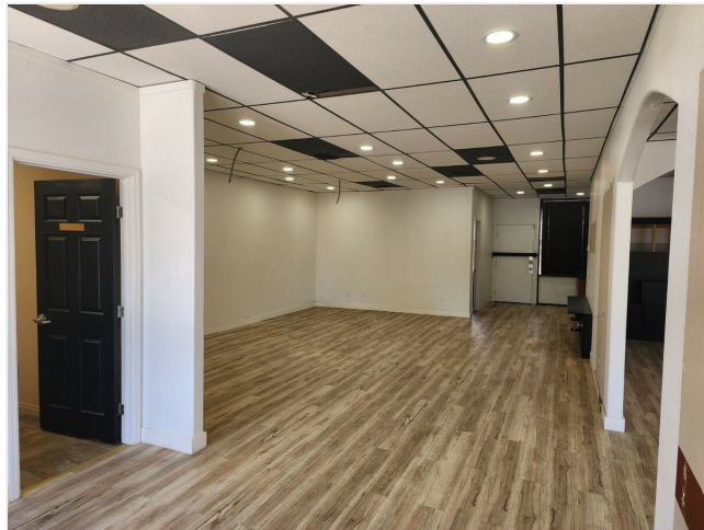
Left side of space