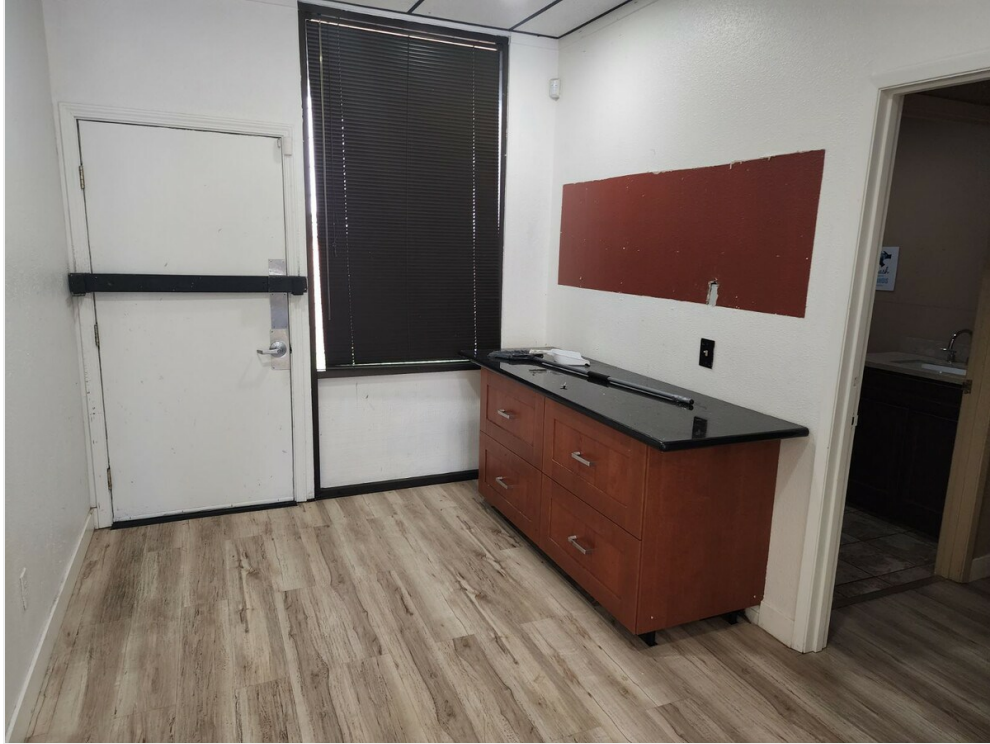
Back of space