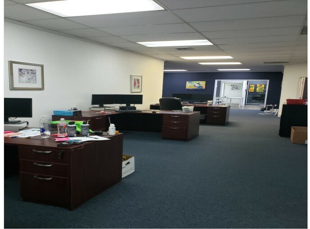
Open area looking towards reception area