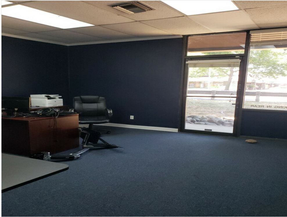
Office 2 suite adjacent to Sunrise Blvd.