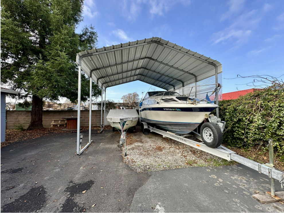
Residential Unit Parking