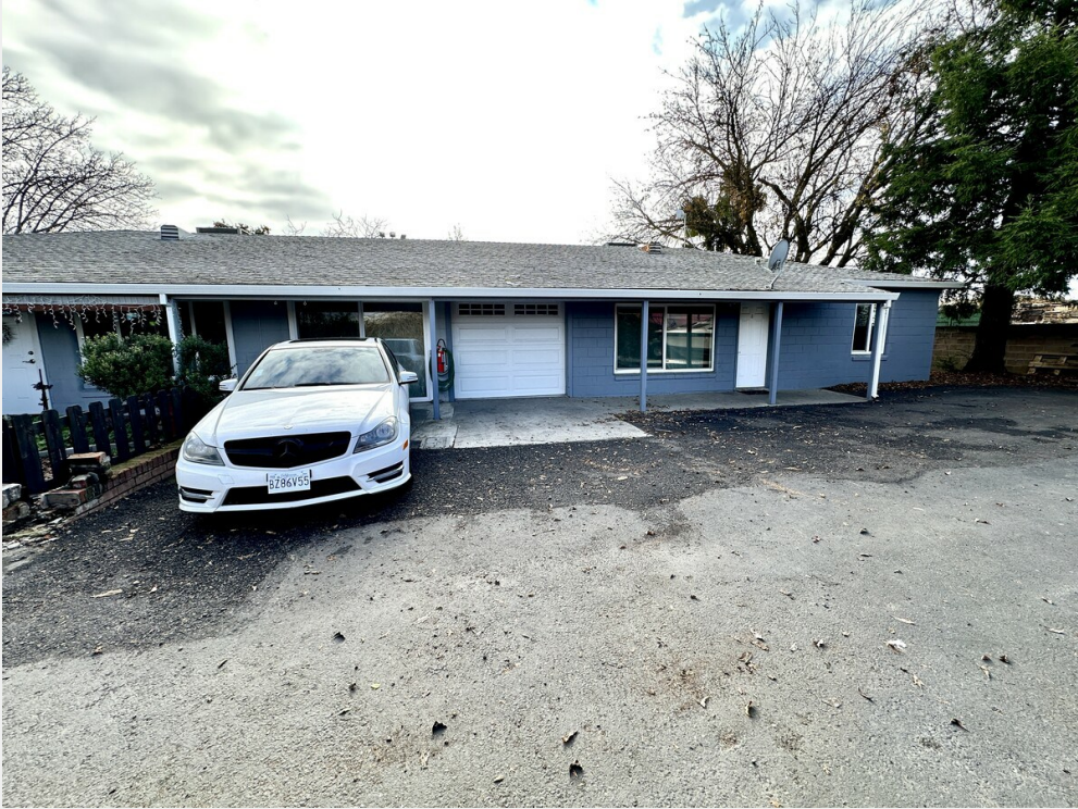
Residential Unit Parking