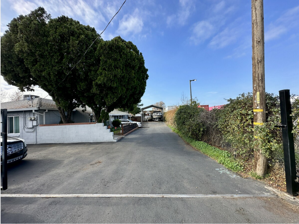
Residential Unit Driveway