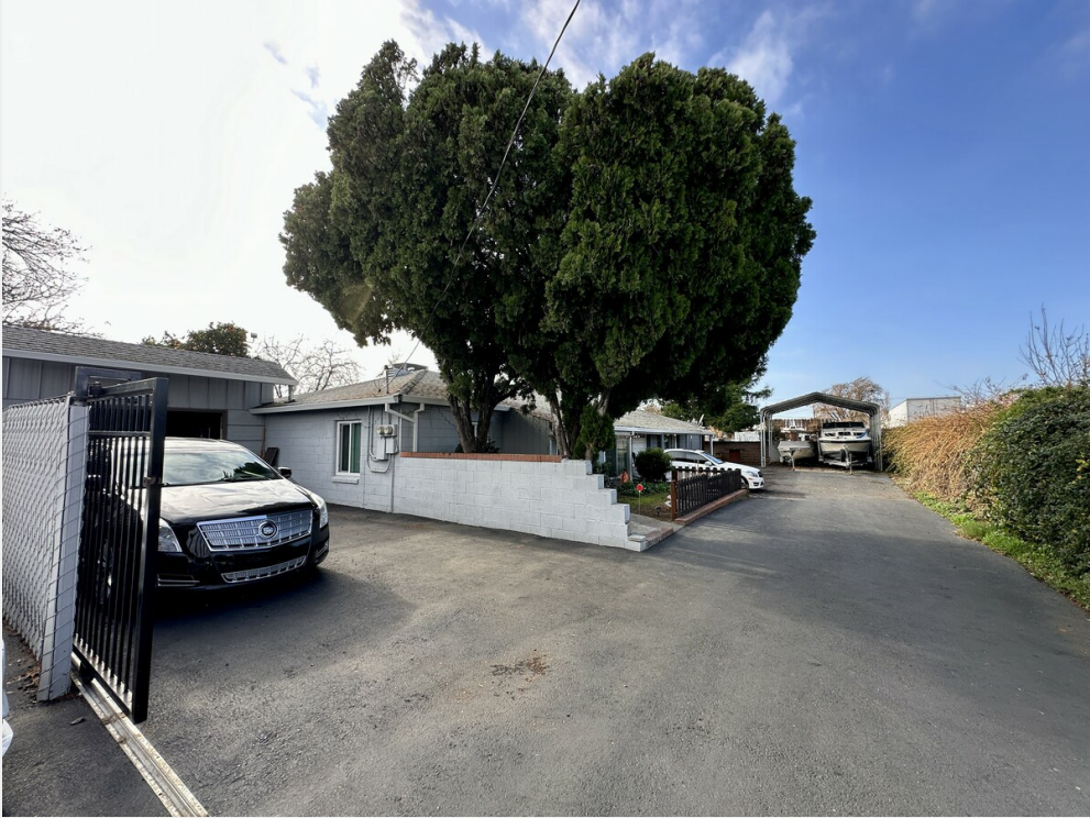
Residential Unit Driveway