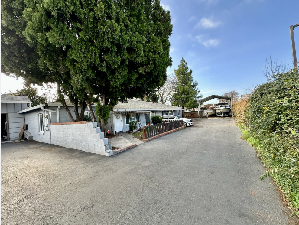
Residential Unit Driveway