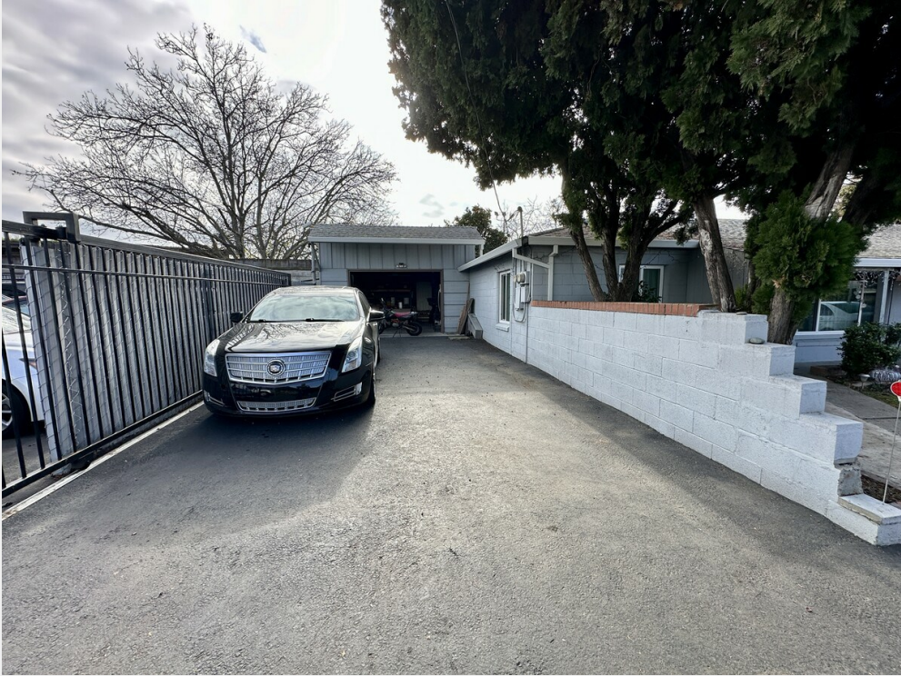
Residential Unit Parking