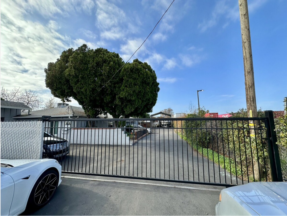
Residential Unit Driveway