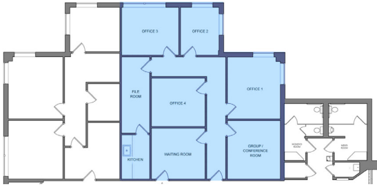
Suite 230 1,738 SF