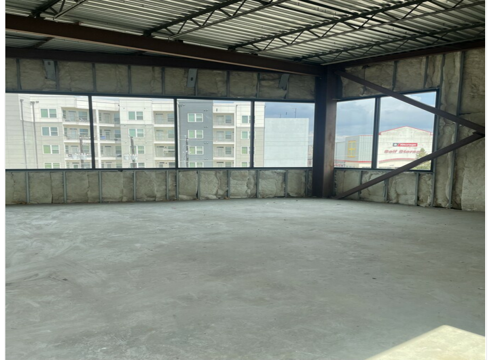
3rd Floor Interior Photo