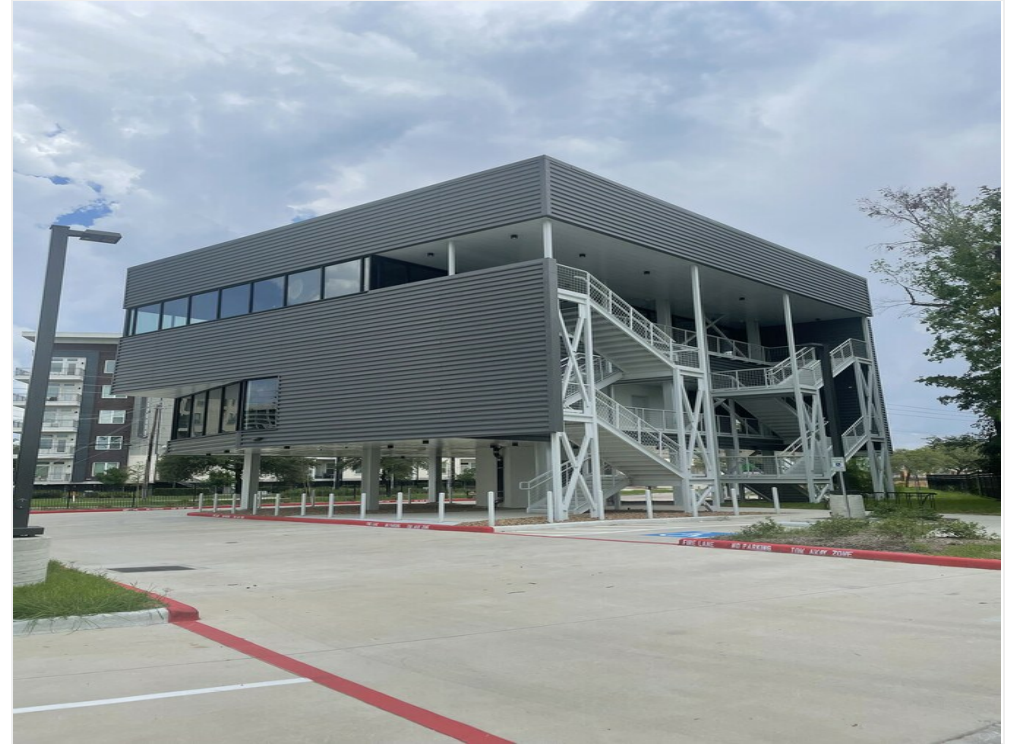
West Side of Building