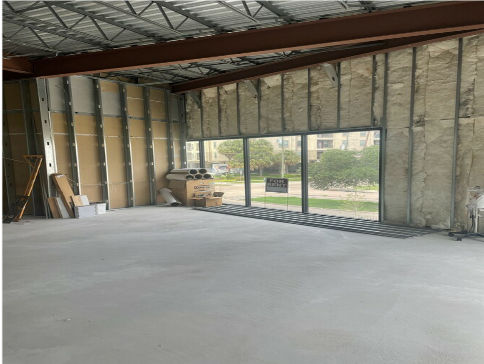
2nd Floor Interior Photo