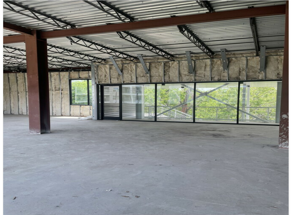
3rd Floor Interior Photo