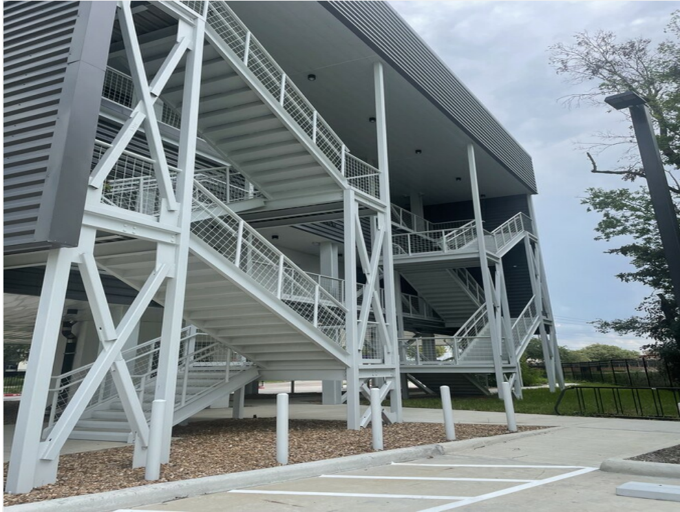
Rear of Building Photo