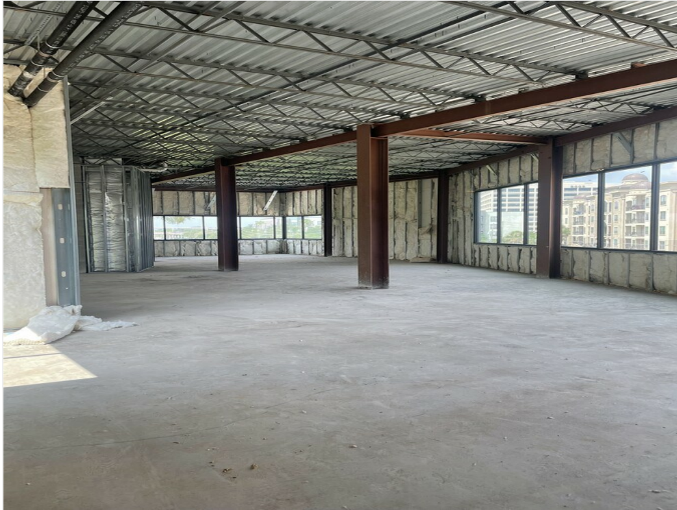
3rd Floor Interior Photo