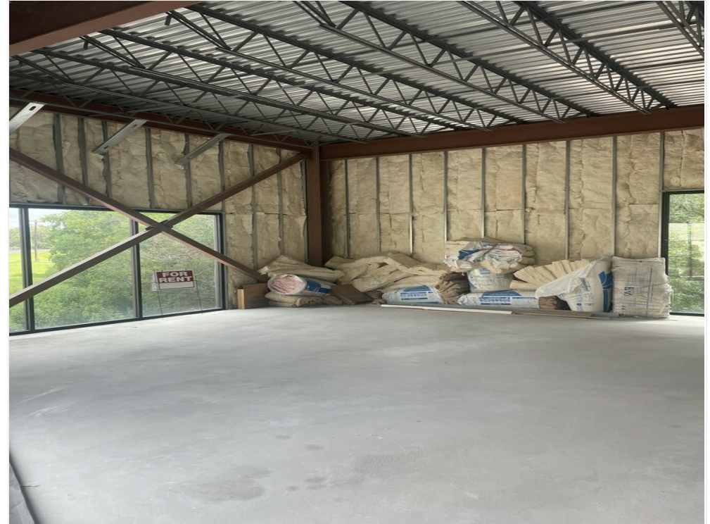
2nd Floor Interior Photo