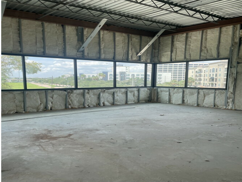
3rd Floor Interior Photo