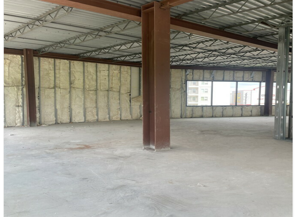
3rd Floor Interior Photo