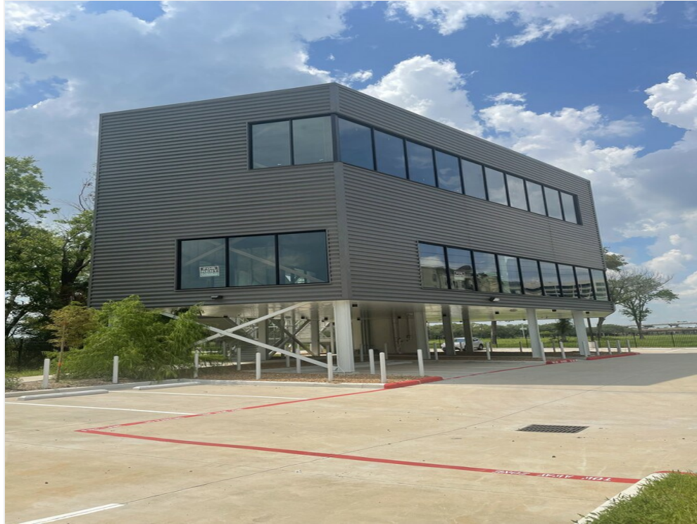
East Side of Building Photo