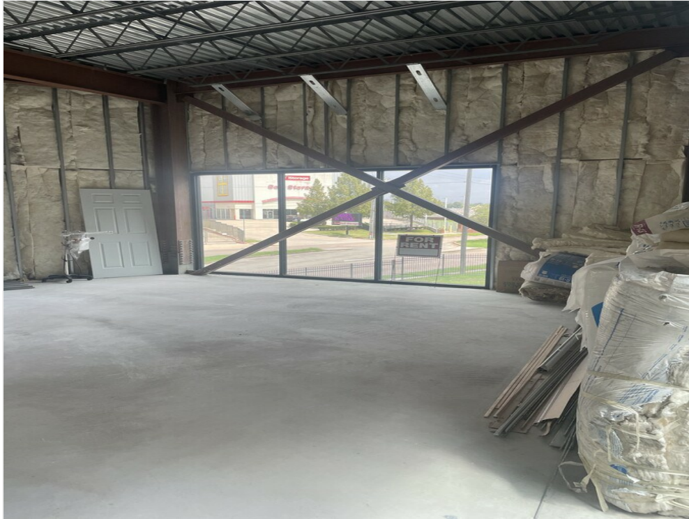
2nd Floor Interior Photo