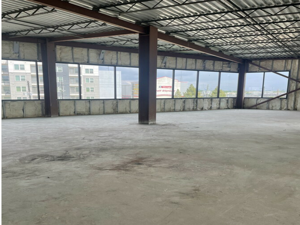
3rd Floor Interior Photo