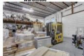
12 foot Overhead Door