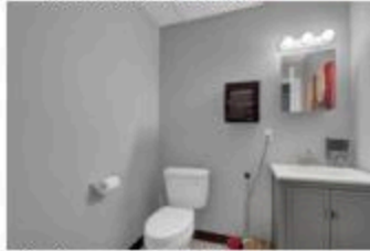
Conference Room Bathroom