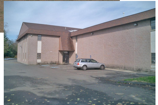
13,020 SF Free Standing Industrial Building