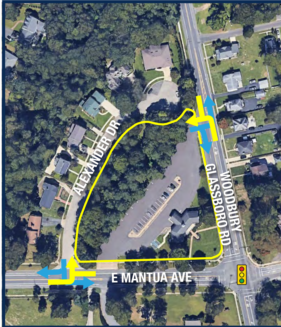
Estimated Property Line