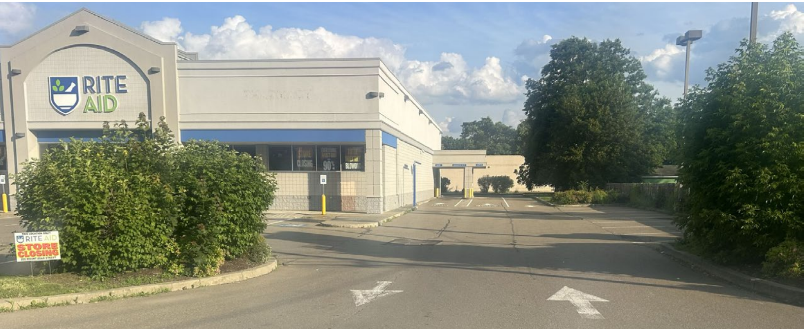
Building has a drive-thru