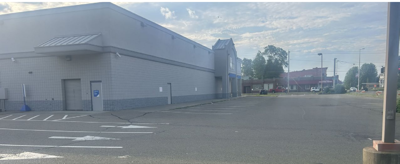
Overhead door for loading

Brian Donovan 716.998.2943 | brian@donovanres.com 460 East Ave, Rochester, NY 14607 www.donovanres.com